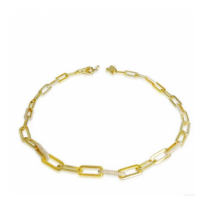
The Pink Mon Cœur Necklace