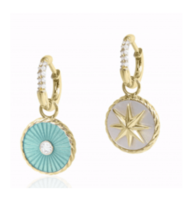
The New Romantics Gold Pearl Earrings