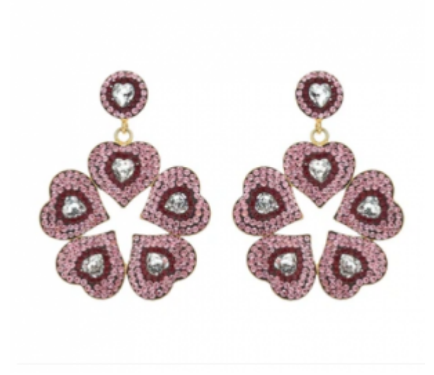
<u>Silver Double Heart Earrings</u>