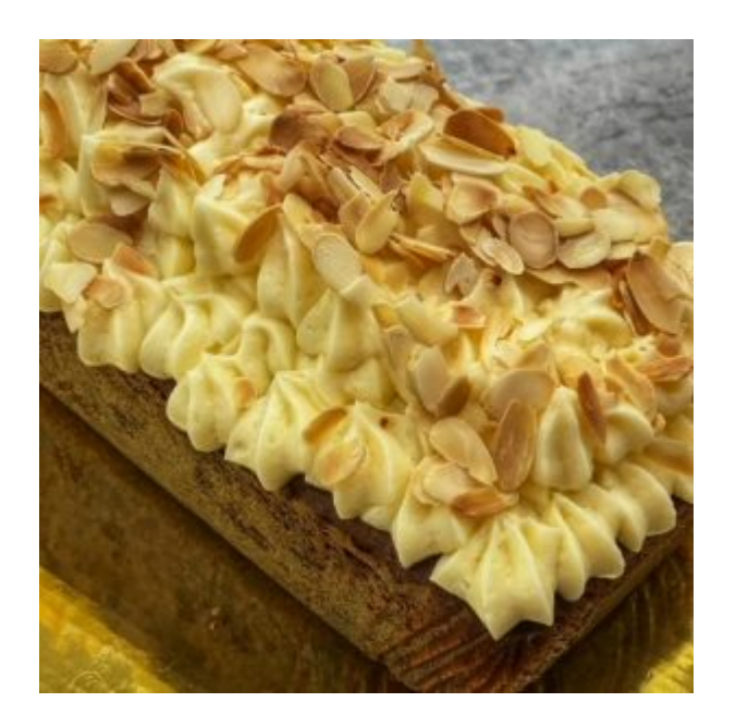
ENJOY! If you opt for Cherry, Almond & White Chocolate Loaf Cake, please do share a picture!