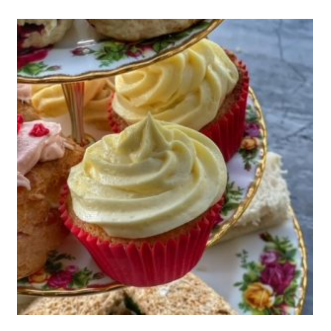
ENJOY! If you opt for Lemon & White Chocolate Cupcakes, please do share a picture!