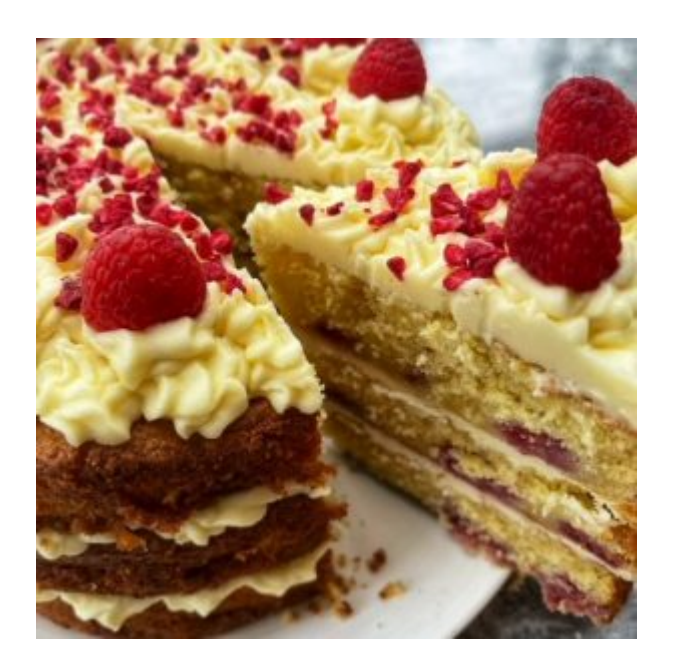
ENJOY! If you opt for Raspberry & White Chocolate Cake, please do share a picture!