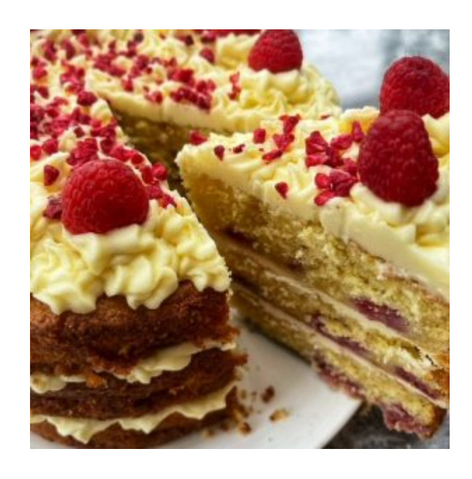
ENJOY! If you opt for Raspberry & White Chocolate Cake, please do share a picture!