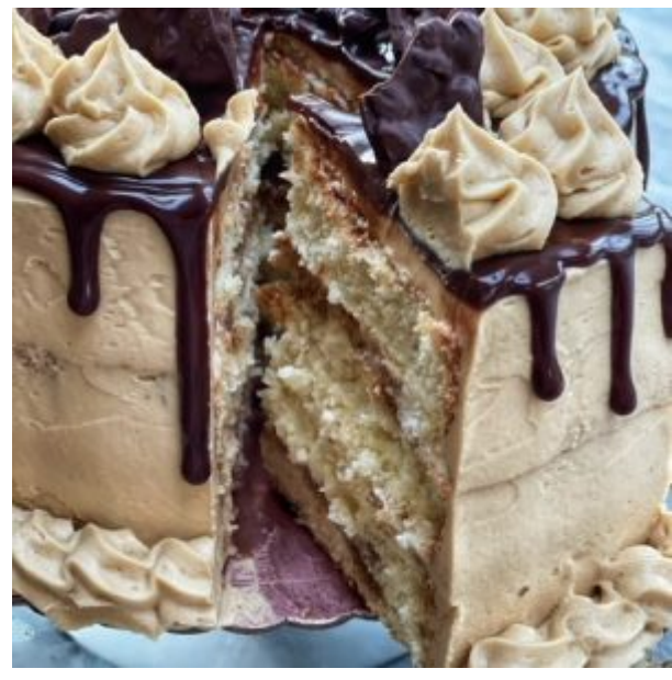
ENJOY! If you opt for Tiramisu Layer Cake, please do share a picture!