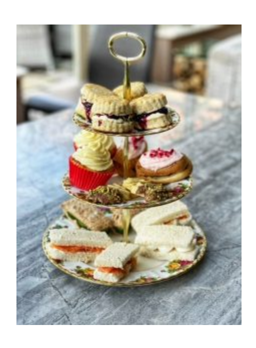
ENJOY! If you opt for Your Perfect Afternoon Tea, please do