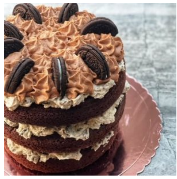
ENJOY! If you opt for Dreamy Oreo Cake, please do share a picture!