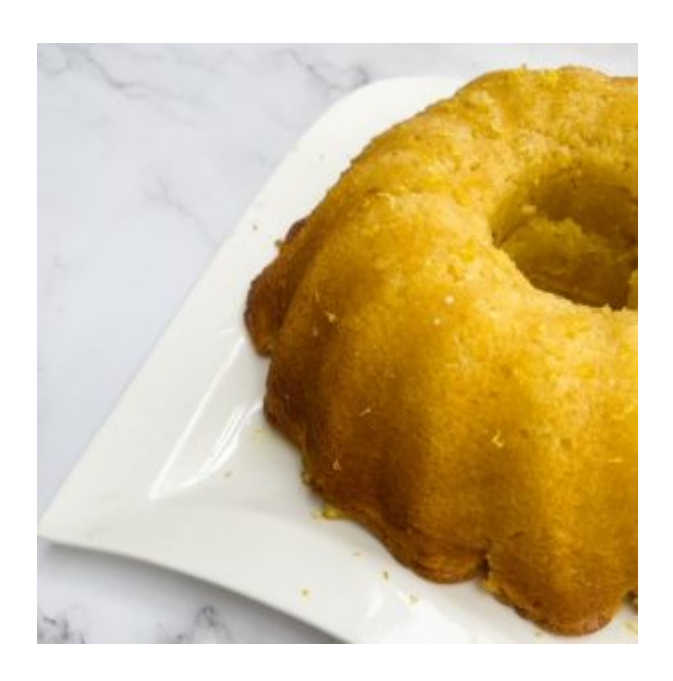
ENJOY! If you opt for Lemon Drizzle Bundt Cake, please do share a picture!