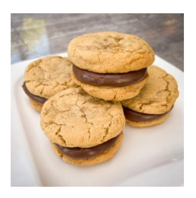
ENJOY! If you opt for Chai Cookie Sandwiches, please do share a picture!