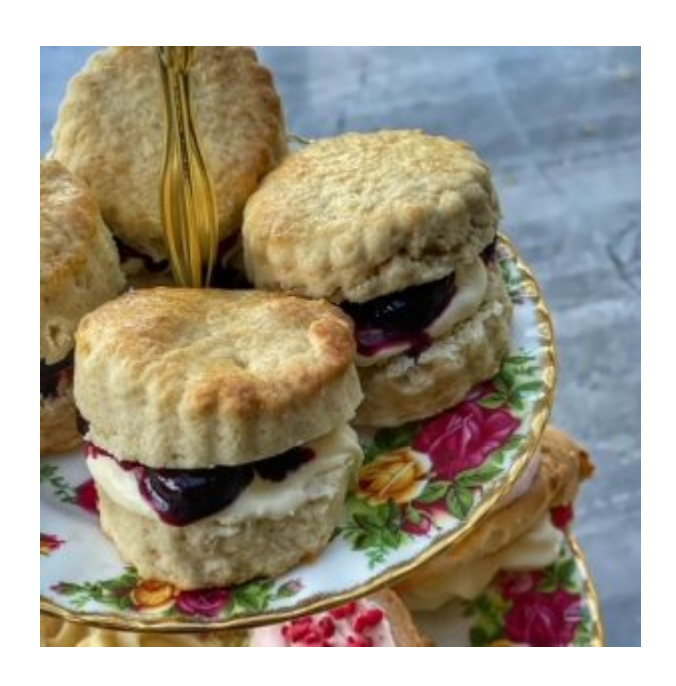
ENJOY! If you opt for Plain scones with clotted cream and blueberry compote, please do share a picture!