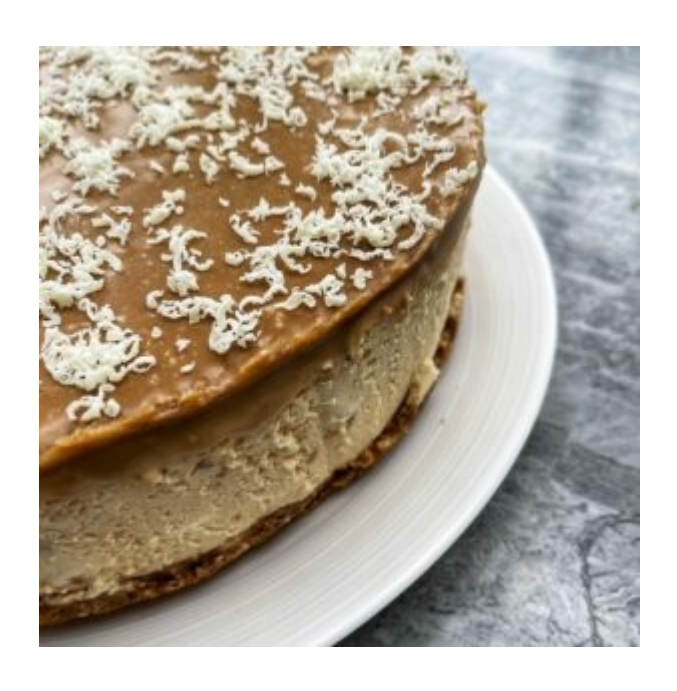
ENJOY! If you opt for Chocolate & Peanut Butter No Bake Cheesecake, please do share a picture!