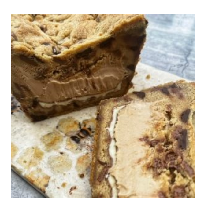
ENJOY! If you opt for Kinder Filled Cookie Loaf, please do