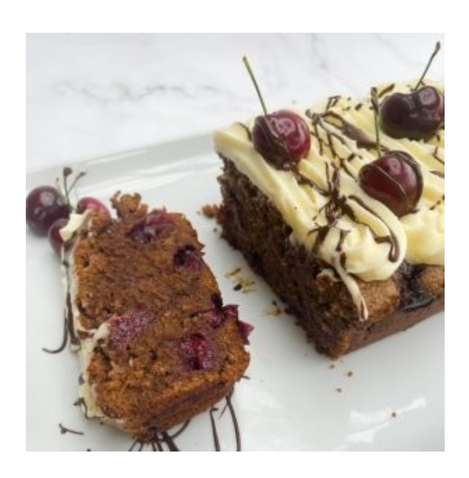
ENJOY! If you opt for Chocolate & Cherry Loaf Cake, please do share a picture!