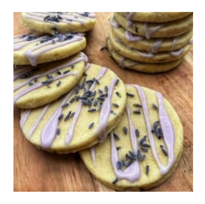
ENJOY! If you opt for Lavender Shortbread, please do share a picture!