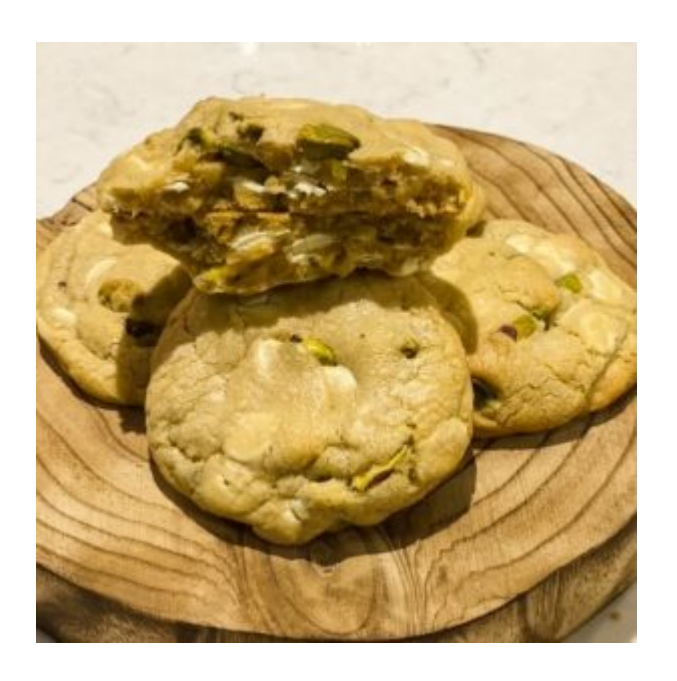
ENJOY! If you opt for Pistachio & White Chocolate Cookies,