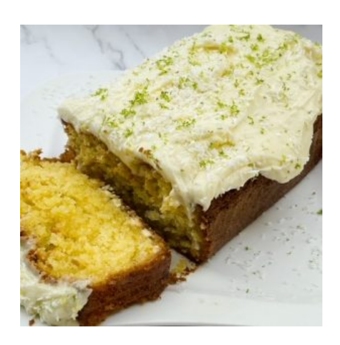
ENJOY! If you opt for Coconut, Lime & White Chocolate Loaf cake, please do share a picture!