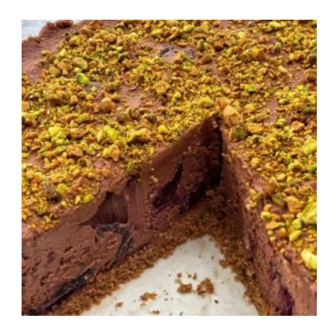
ENJOY! If you opt for Black Forest & Pistachio Cheesecake, please do share a picture!