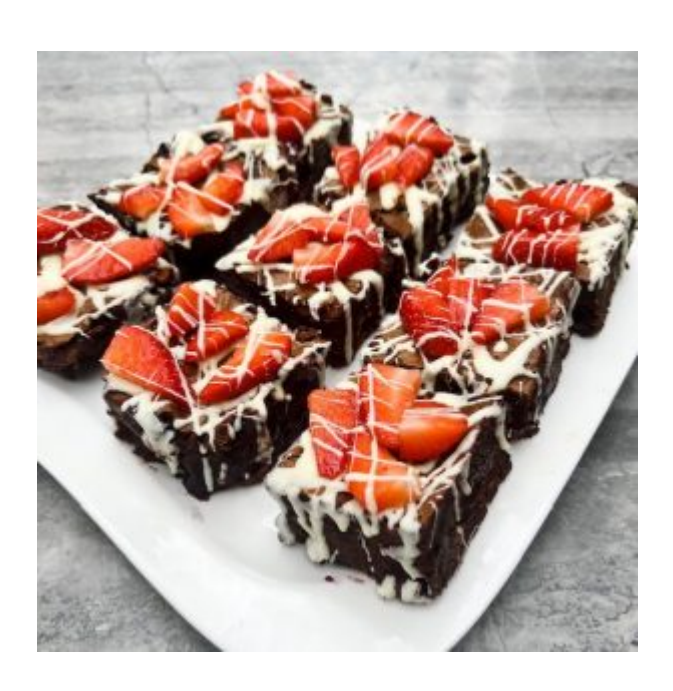
ENJOY! If you opt for Blueberry & Strawberry Double Chocolate Brownies, please do share a picture!