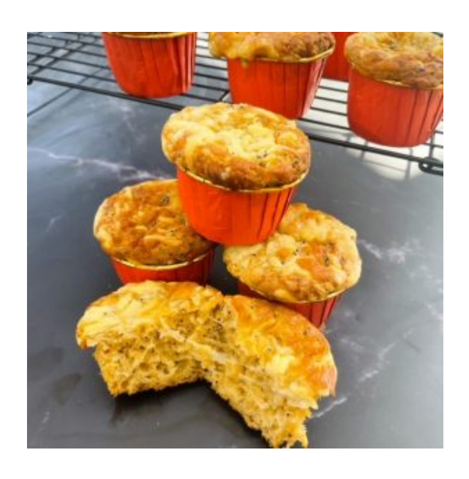
ENJOY! If you opt for Rhubarb & Mango Savoury Muffins, please do share a picture!