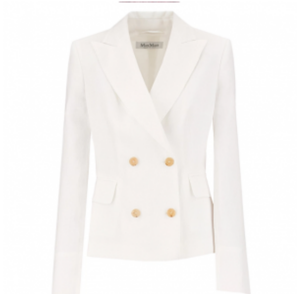
Max Mara Linen Blazer, £815 – here