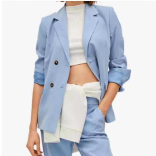
Mango Structured Suit Blazer, Sky Blue, £69.99 – here