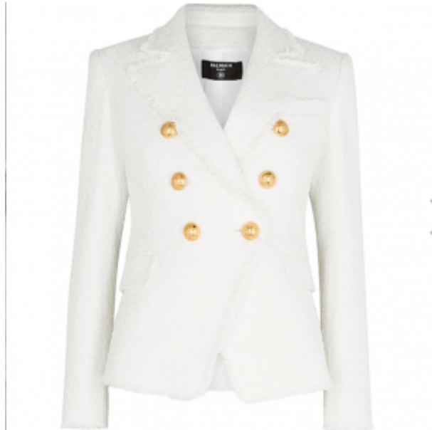
Balmain White Double Breasted Blazer £1,750 – here