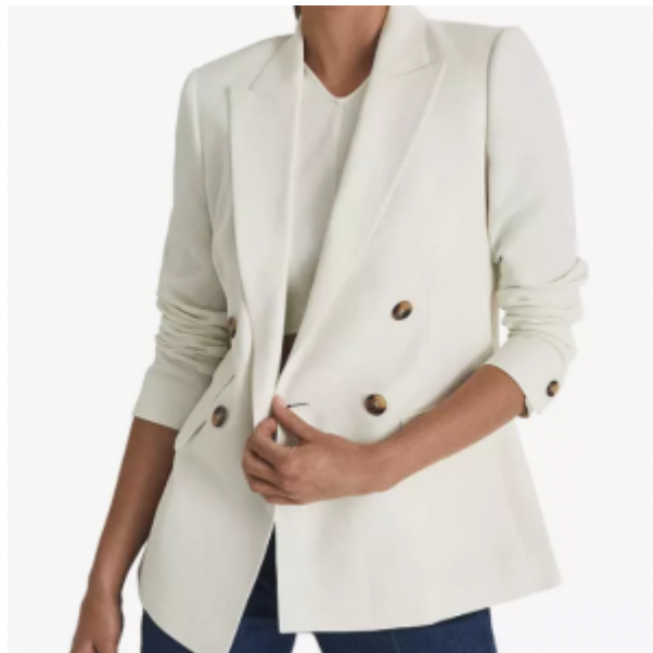
Reiss Faye Double Breasted Blazer, White, £250 – here