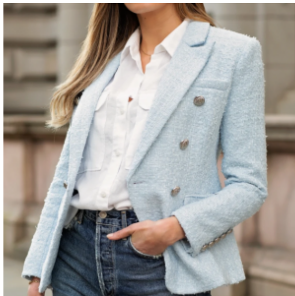
Knightsbridge blazer powder blue, Fox London £200 – here