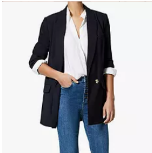
Mint Velvet Navy Twill Blazer, £128 – here