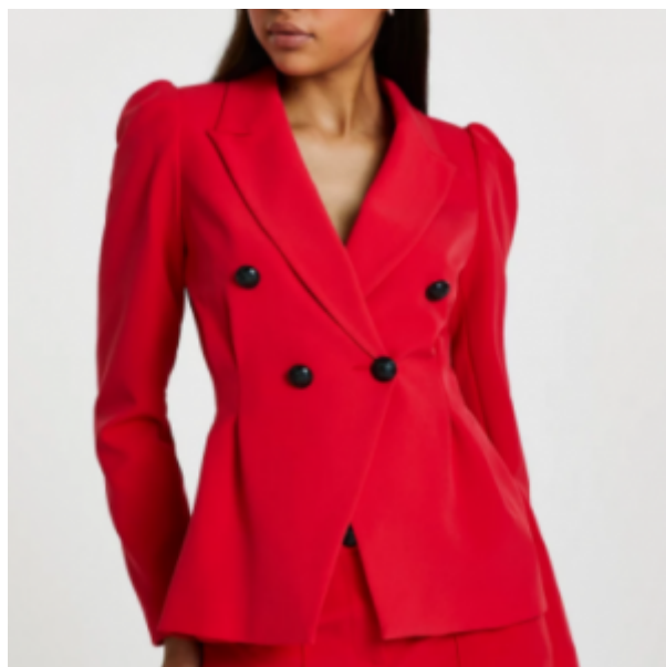
Red double breasted cinch waist blazer, River Island £68.00 – here