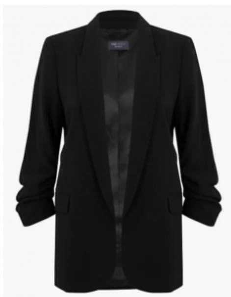
Ruched Sleeve Blazer, Marks & Spencer £45.00 – here