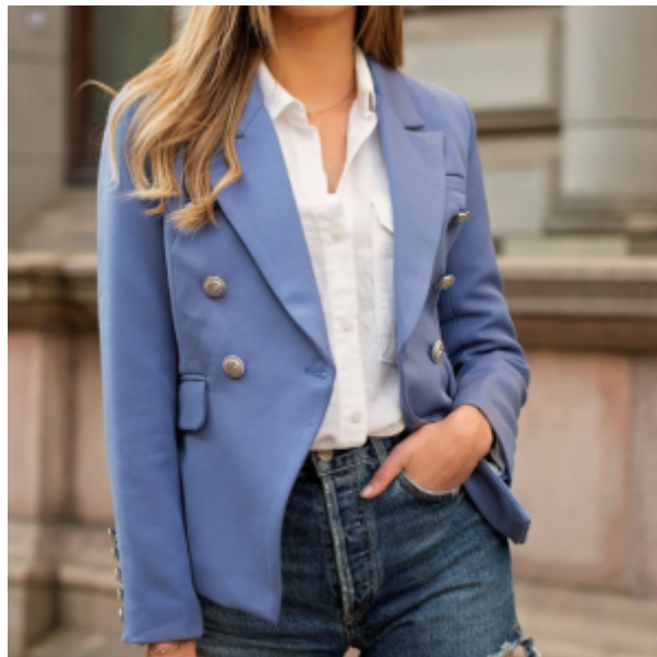
Windsor Blazer wedgewood blue, Fox London £200 – here