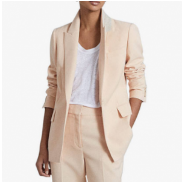
Reiss Evelyn Wool Blend Slim Fit Blazer, Apricot, £235 – here