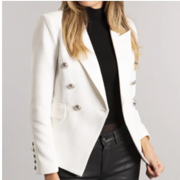
Windsor Blazer Oyster White, Fox London £200 – here