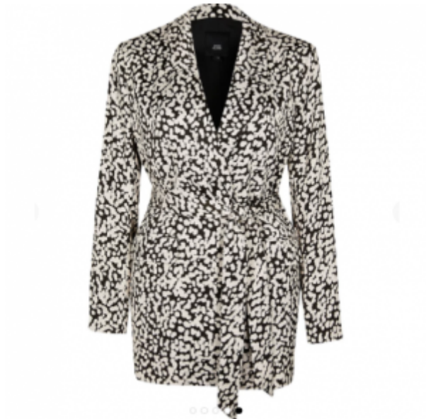
Beige soft printed blazer, River Island £65.00 – here