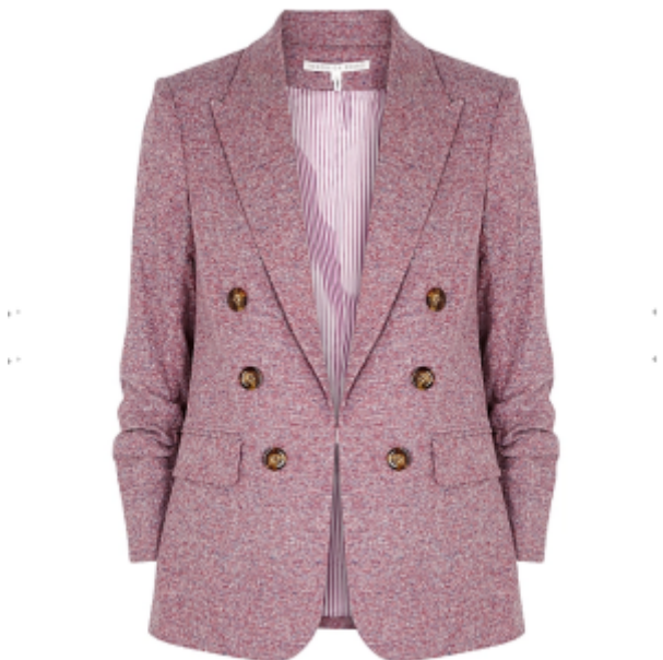
Beacon Dickey pink tweed blazer, Veronica Beard £530 – here