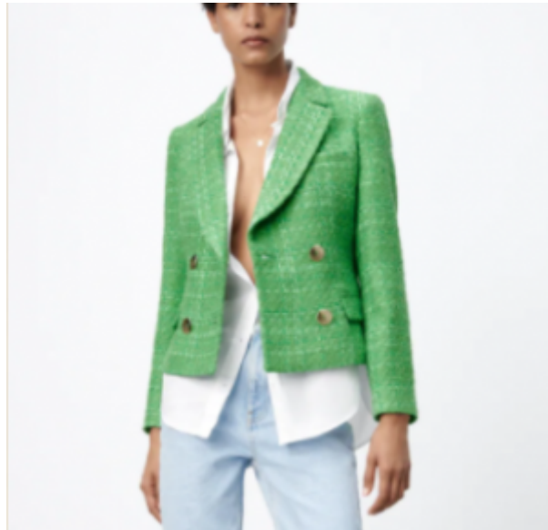
Textured double breasted blazer, Zara £59.99 – here