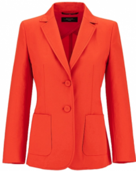
Linen and cotton blazer, Weekend Max Mara £295 – here