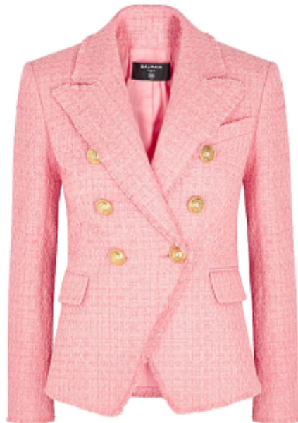
Balmain Pink Double Breasted Blazer £1,750 – here