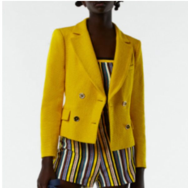
Textured Crop blazer, Zara £59.99 – here