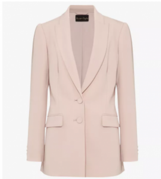
Phase Eight Cadie Suit Jacket, Antique Ros, £143.20 – here