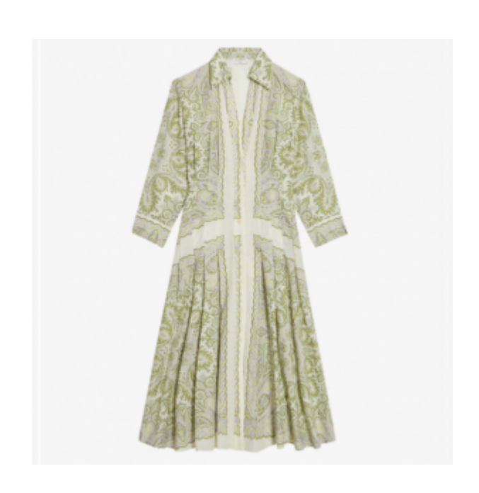
SANDRO Margaret paisley-print linen-blend midi shirt dress {\tt £263.40-\underline{here}}