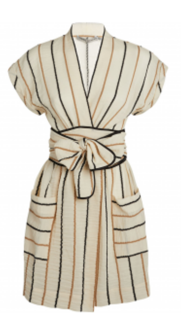
Three Graces Striped Aurora Wrap Dress £390 - here