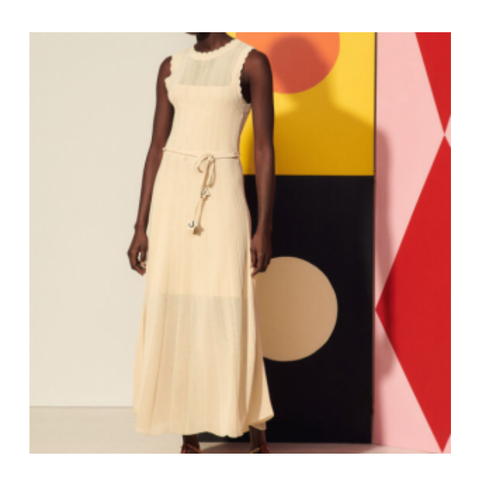
Sandro Long Knitted Dress £299 — <a href="here">here</a>