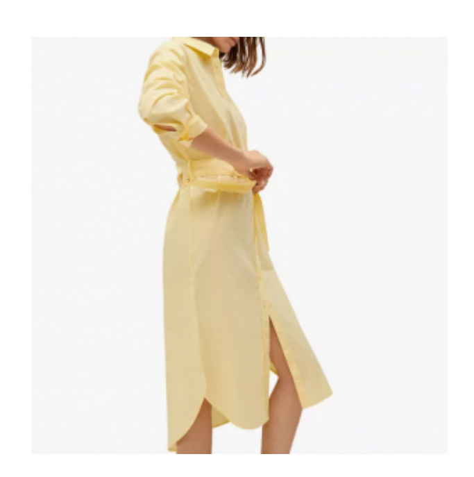
Mango Long Cotton Shirt Dress, Yellow £19.99 — <a href="here">here</a>