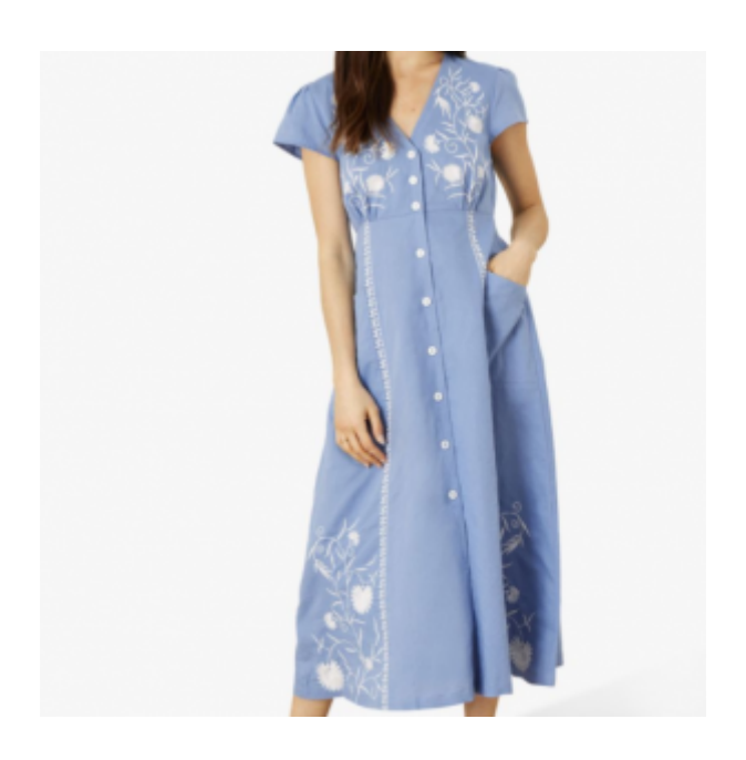
French Connection Duna Lawn Dress, Summer White, £90