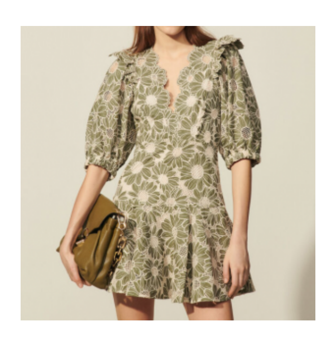
Sandro short embroidered dress £329 — <a href="here">here</a>