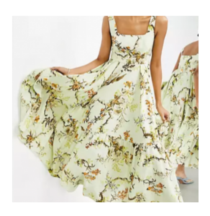
ASOS EDITION sleeveless square neck tiered midi dress in woodland print £110 — \frac{\text{here}}{\text{mem}}