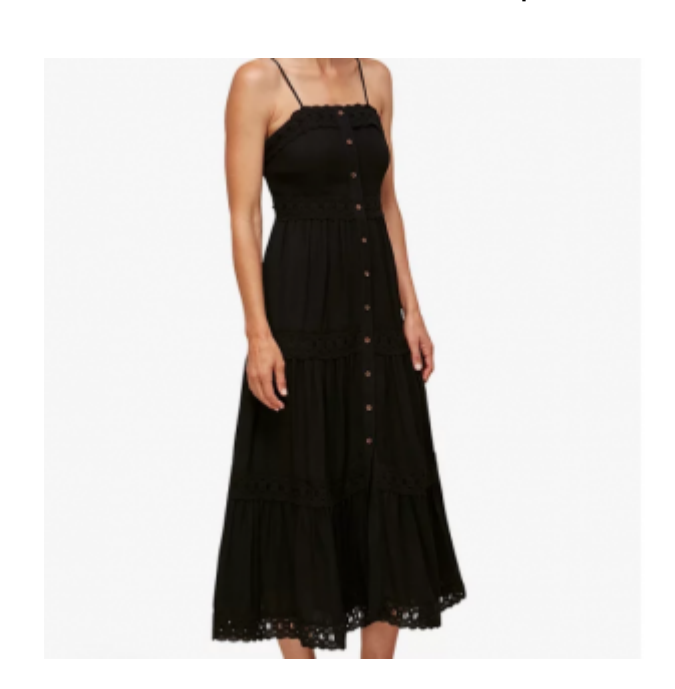
Whistles Strappy Lace Dress, Black £119 — <a href="here">here</a>