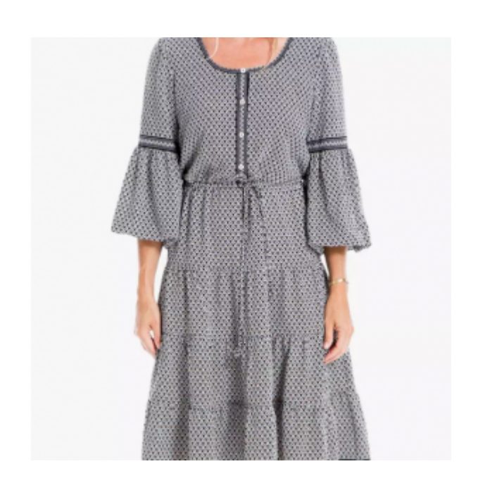
Max Studio Tie Waist Tiered Dress, Multi £35.30 — <a href="here">here</a>