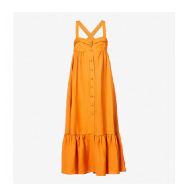
SANDRO Tulipe sleeveless woven maxi dress £230.30 — <a href="here">here</a>