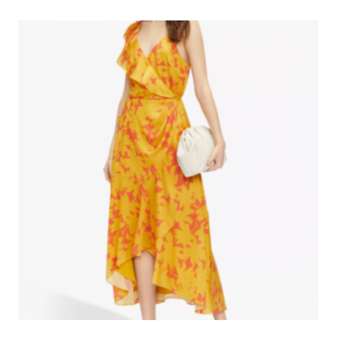
Chi Chi London Leta Lace Mini Dress, White £75 — <a href="here">here</a>