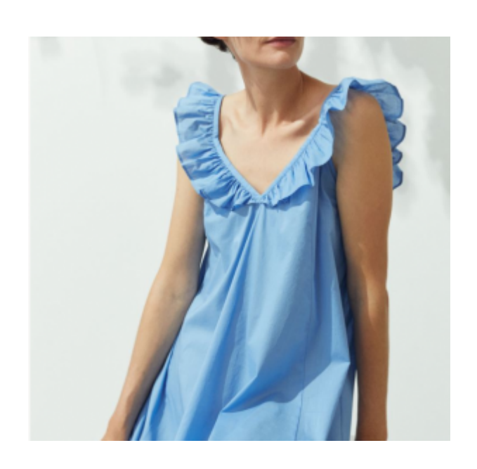
H&M Flounce-detail dress £9 — <a href="here">here</a>