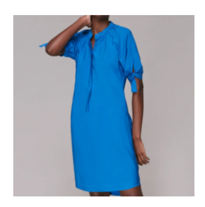
Whistles Celestine Dress £99 - <a href="here">here</a>