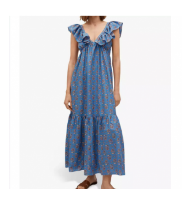
Mango Floral Print Ruffle Detail Maxi Dress, Blue £35.99 — <a href="here">here</a>