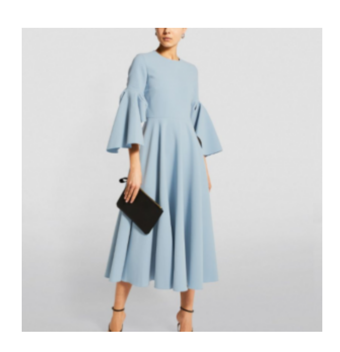
ROKSANDA Ayres Midi Dress £769.30 — <a href="here">here</a>