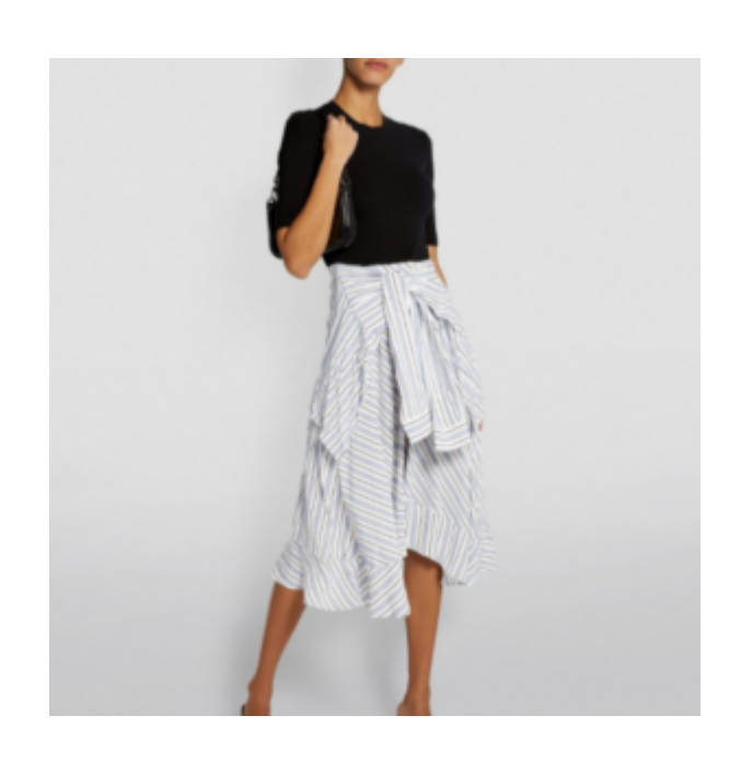
MAJE Trompe-L'Oeil Striped Dress £195.30 — <a href="here">here</a>