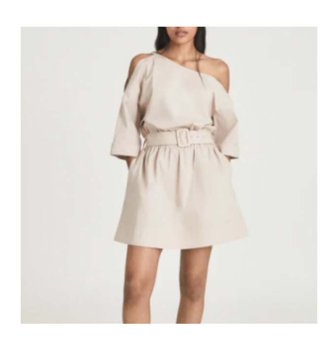
Reiss Demi one shoulder mini dress £188 — <a href="here">here</a>