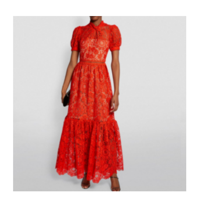
SELF-PORTRAIT Guipure Lace Maxi Gown £208.99 — <a href="here">here</a>