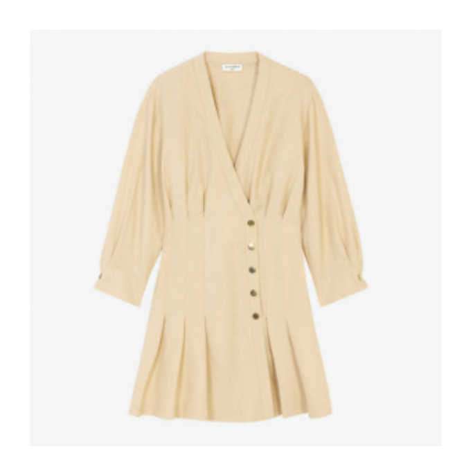
SANDRO Annie woven mini wrap dress £179.40 - here