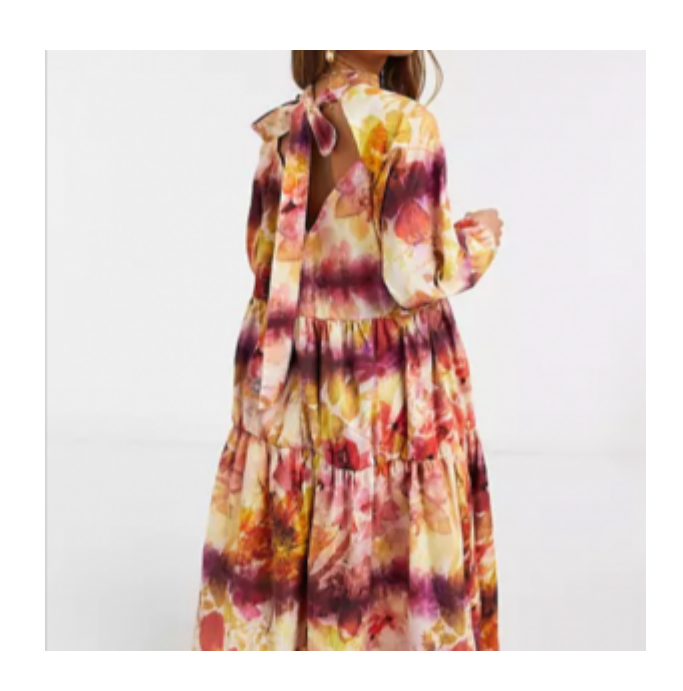
Damson Madder tiered organic cotton maxi dress in floral with bow neck tie £130 - here