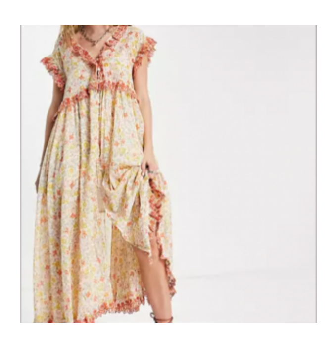
Free People milania midaxi dress with ruffle trims in vintage floral £158 — \frac{\text{here}}{\text{opt}}