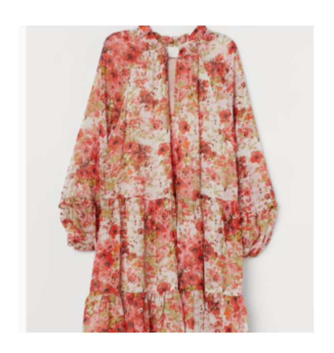
H&M Chiffon dress £15 - here