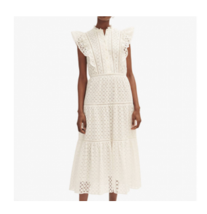
Jigsaw Tiered Broderie Anglaise Maxi Dress, White £129 — <a href="here">here</a>