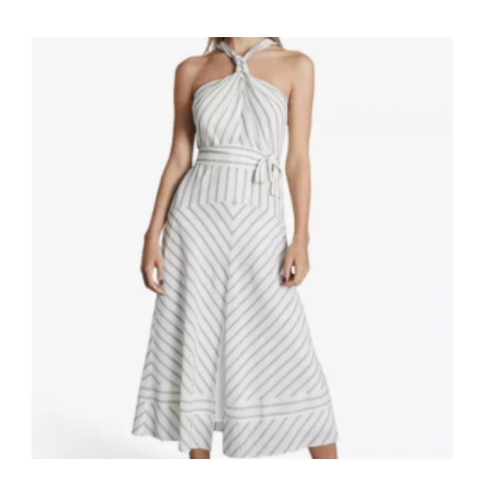
Reiss Bea Striped Dress, White/Grey £140 - here