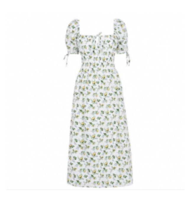
FAITHFULL THE BRAND, FAITHFUL FLORA MIDI LD12, £149 — <a href="here">here</a>