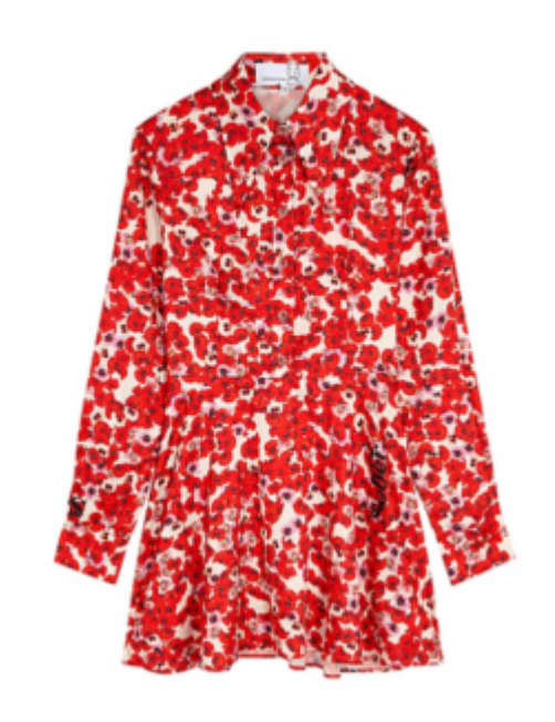
NATASHA ZINKO Red floral-print satin mini dress £405.00 — <a href="here">here</a>