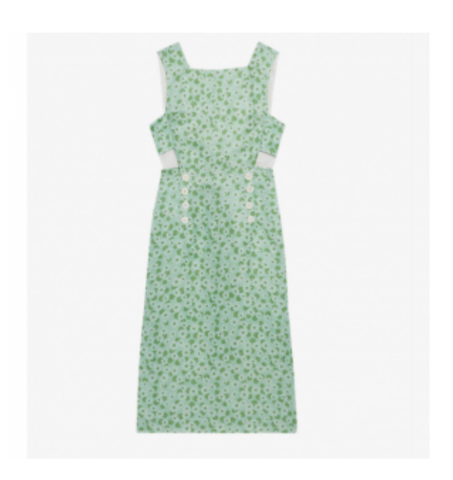
SANDRO Ashley linen and silk-blend midi dress £223.30 — <a href="here">here</a>