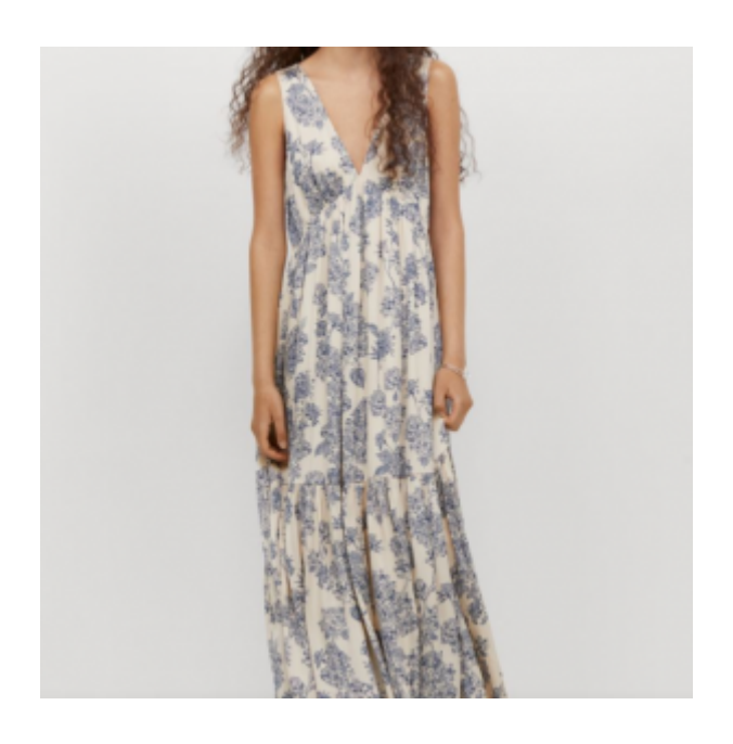
Tie-belt dress, H&M £34.99 - here