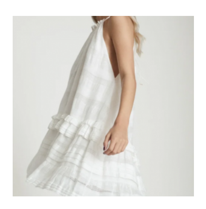
Reiss Gabriella Linen Blend Dress £195 — <a href="here">here</a>