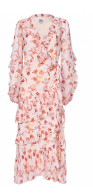
True decadence peach orange floral wrap midi dress £81.00 - \frac{\text{here}}{\text{c}}