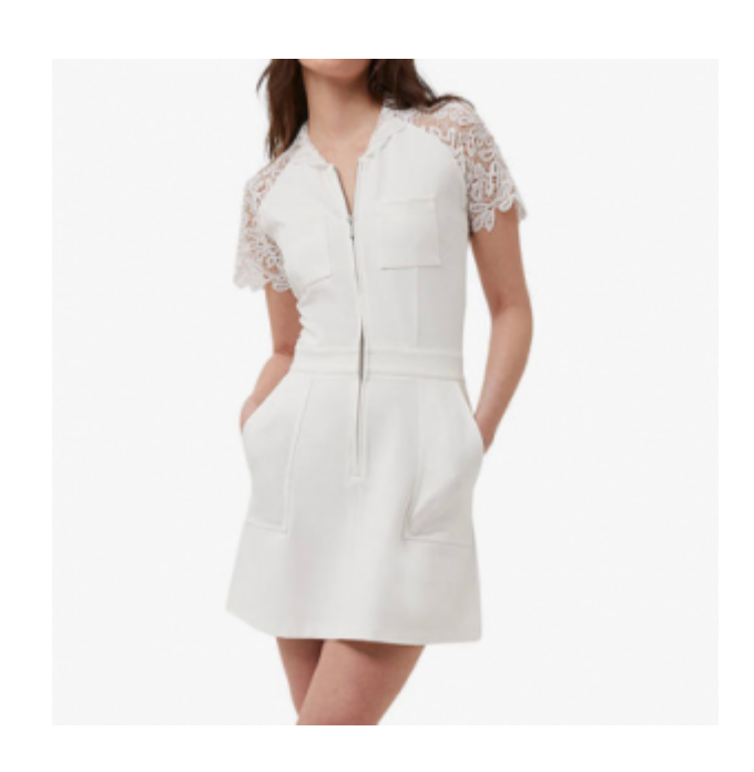
French Connection Simonah Lace Detail Mini Dress, White £57 — <a href="https://here.ncb/here">here</a>