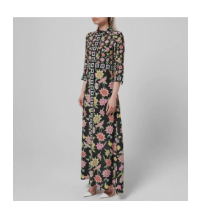
HAYLEY MENZIES DREAM MAXI DRESS £319 - here