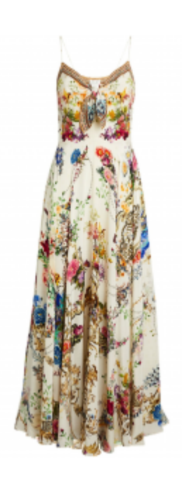
Camilla By the Meadow Maxi Dress £650 — <a href="here">here</a>