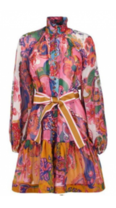
ZIMMERMANN LOVESTRUCK DRESS £599 — <a href="here">here</a>