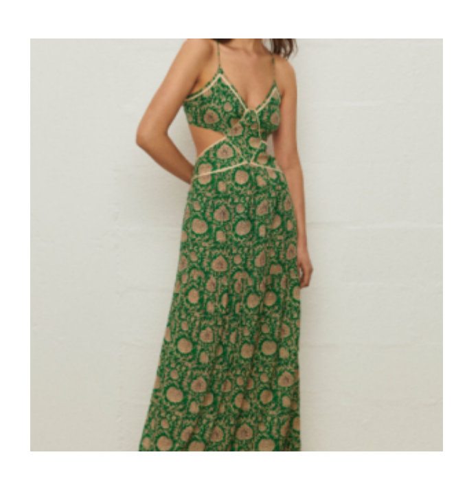
Ba&sh Paloma Maxi Dress £300 — <a href="here">here</a>