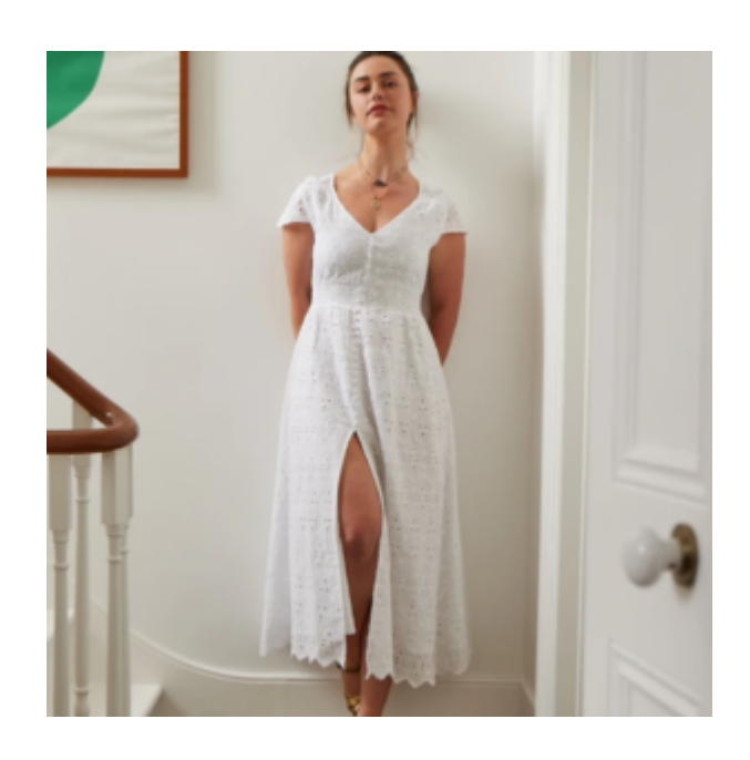
Marie & Lola Oriane Dress £79 — <a href="here">here</a>