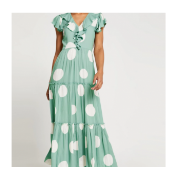
River Island, Turquoise short sleeve frill tier midi dress £42 – <a href="here">here</a>