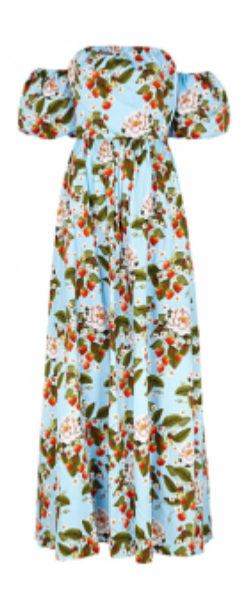
BORGO DE NOR Juliet floral-print cotton maxi dress £486.00 - <a href="here">here</a>