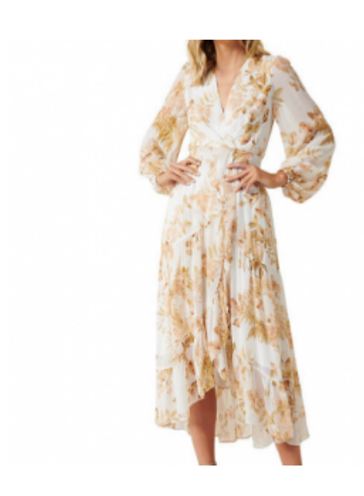
Forever New Lola Floral Maxi Dress, Tonal Botanics £68.75 — <a href="here">here</a>