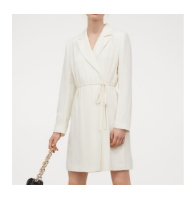
H&M Jacket dress £20 — <a href="here">here</a>