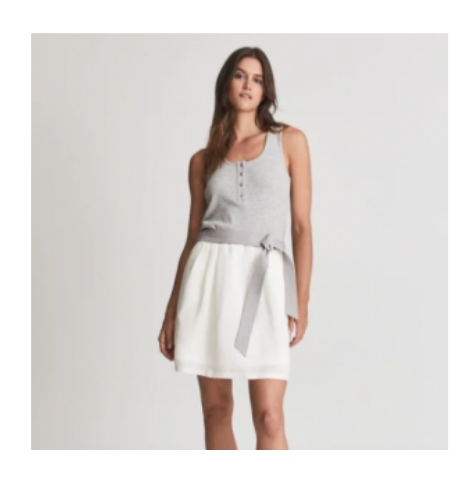
Reiss ZETA JERSEY TOP MINI DRESS WHITE/GREY £75 — <a href="here">here</a>