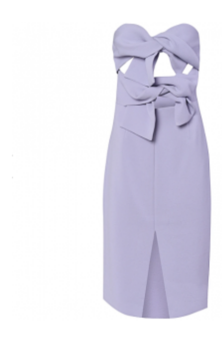
True Decadence Lavender grey strapless bow midi dress £54.00 - <a href="here">here</a>