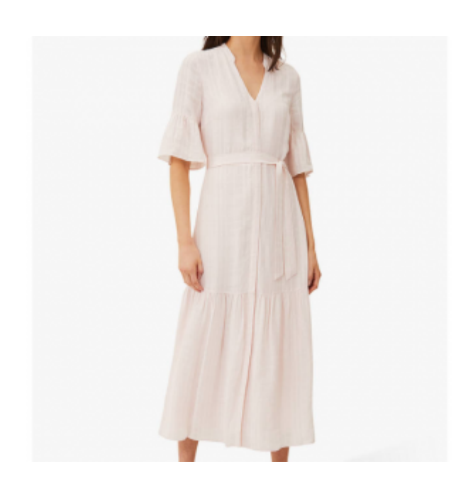
Phase Eight Germaine Maxi Dress, Pink £69 — <a href="here">here</a>