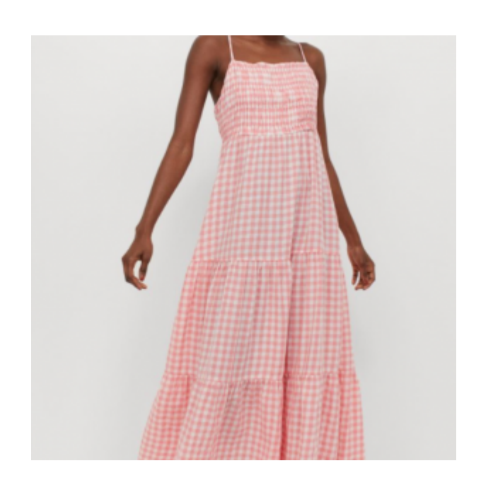
H&M Smocking-detail dress £39.99 — <a href="here">here</a>