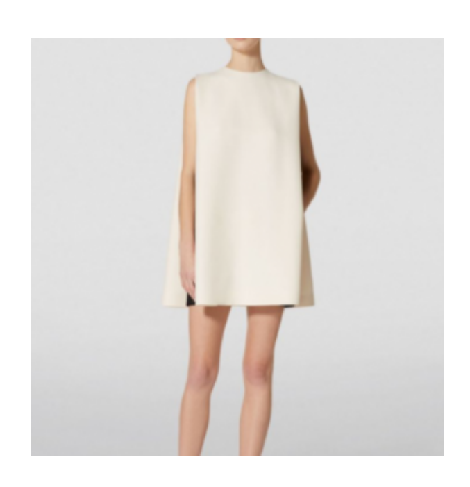
VALENTINO Wool-Silk Mini Dress £1,134 — <a href="here">here</a>