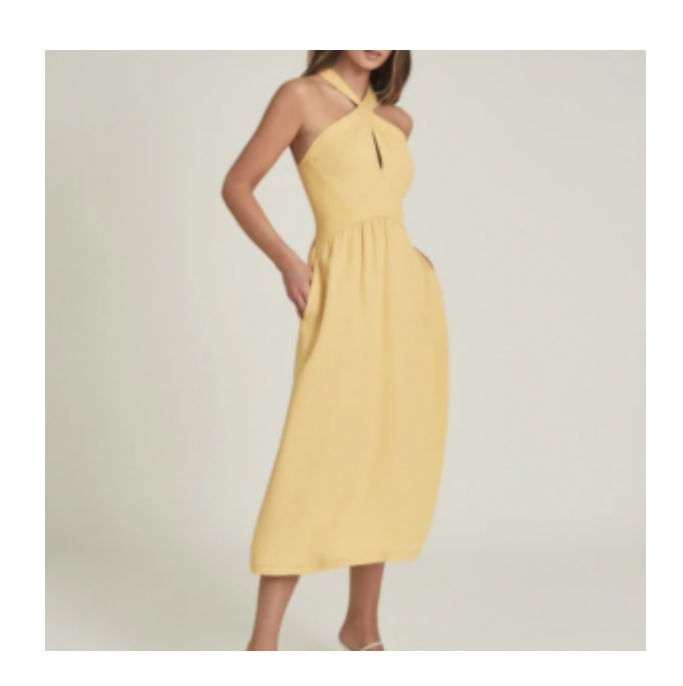
Reiss Orla Halter neck midi dress £185 — <a href="here">here</a>