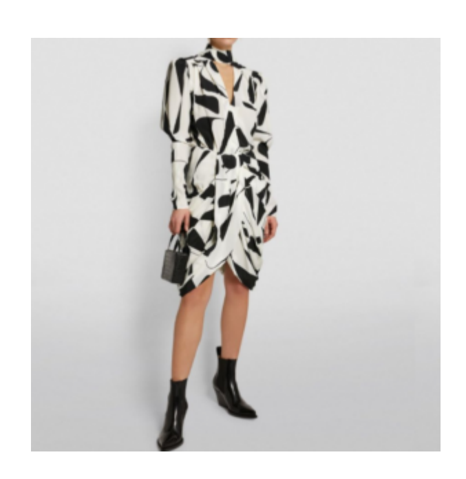
ISABEL MARANT Printed Atoae Dress £525.03 — <a href="here">here</a>