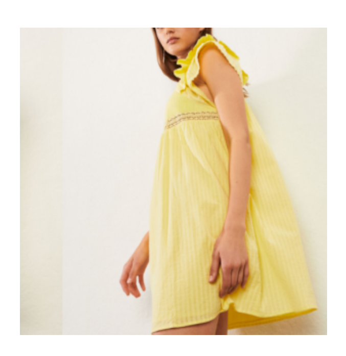
Ba&sh Uriel Short Dress £195 — <a href="here">here</a>