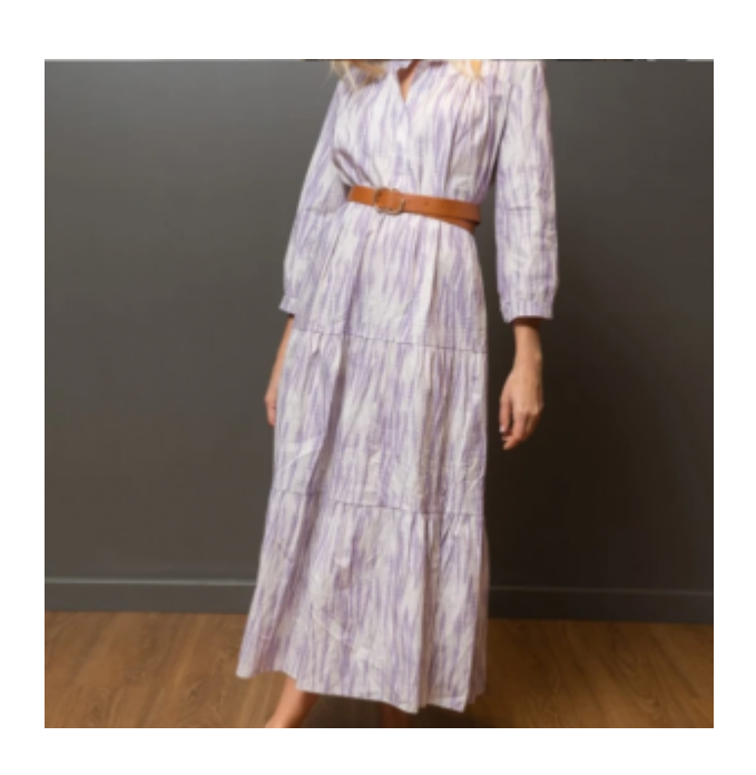
Marie & Lola Audrey maxi dress £69 — <a href="here">here</a>