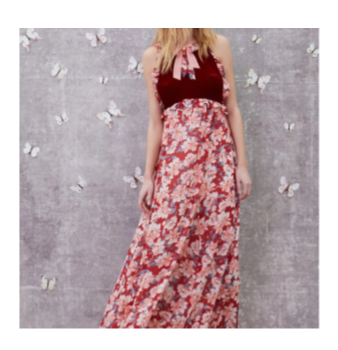
FOR LOVE & LEMONS BLOSSOM TANK MAXI DRESS £247.50 - here