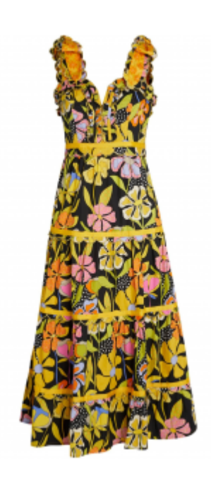
Celia B Midi Flora Dress £385 — <a href="here">here</a>