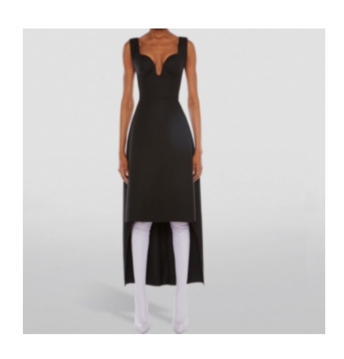
ALEXANDER MCQUEEN Plunge-Neck Dress with High-Low Hem {\tt f1,015.01-\underline{here}}