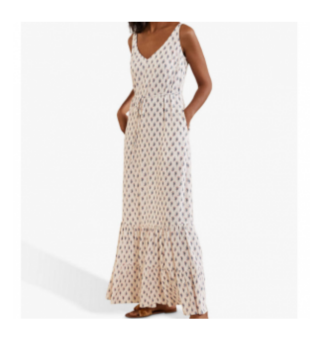
Boden Alicia Paisley Maxi Dress, Ivory £63 — <a href="here">here</a>