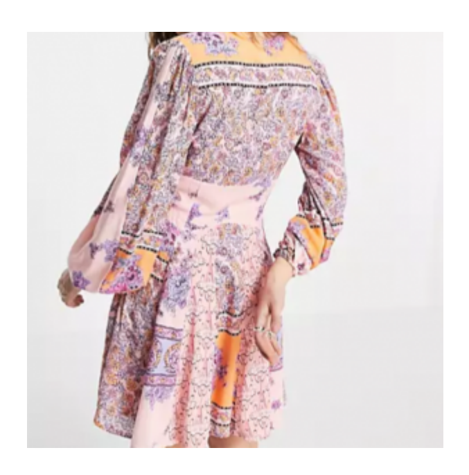
Free People tie front mini dress in pink paisley print £108 - \frac{\text{here}}{\text{opt}}