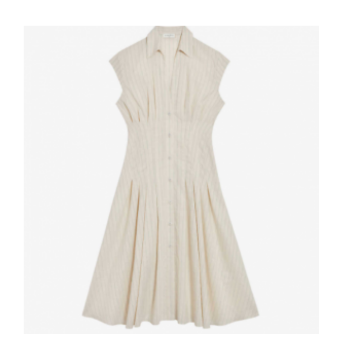
SANDRO Andrina striped woven midi dress £149.50 — <a href="here">here</a>