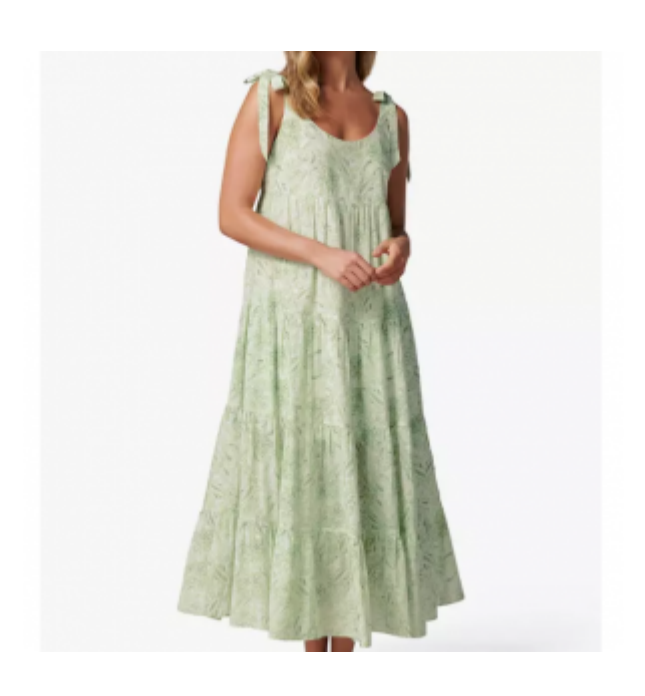
Forever New Nicole Paisley Print Tiered Maxi Dress, Evergreen Paisley, £48.00 — <a href="https://example.com/here">here</a>