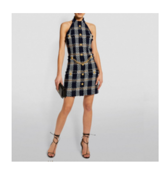
BALMAIN Halterneck Tweed Dress £1,225.01 — <a href="here">here</a>