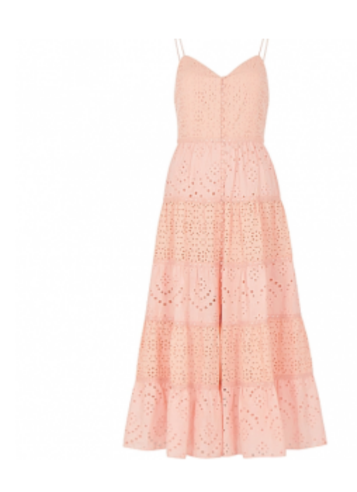
Alice & Olivia Shanti pink eyelet-embroidered cotton midi dress £450 — \frac{\text{here}}{\text{here}}