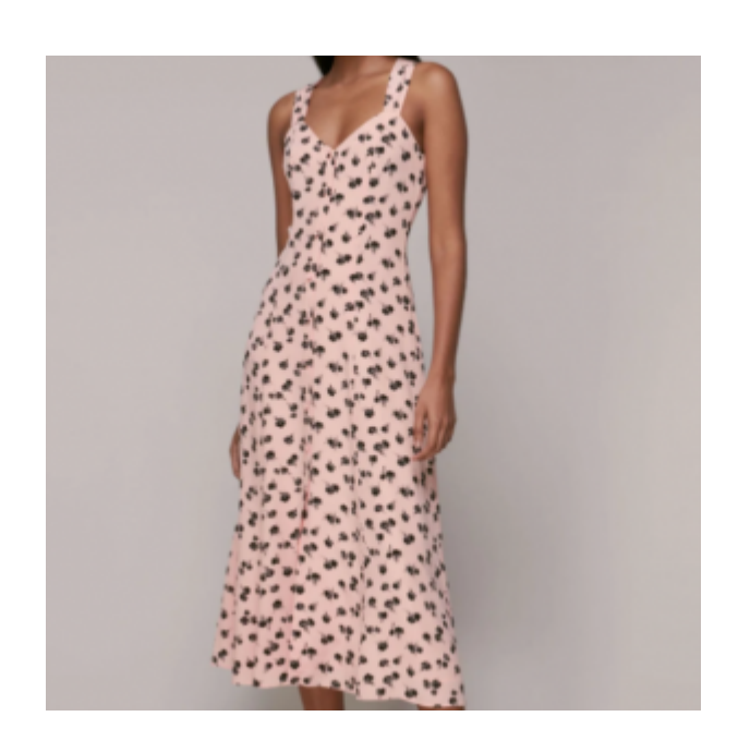
Whistles Scattered Carnation Midi Dress £149 — <a href="here">here</a>