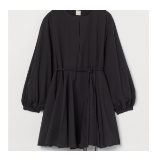
Linen-blend dress, H&M £24.99 — <a href="here">here</a>