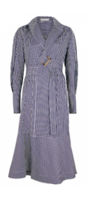
PALMER//HARDING Calli striped cotton wrap dress £217.00 -