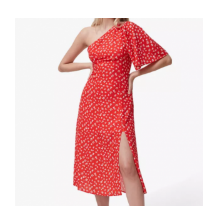
French Connection Fayola Floral Print Dress, Fiery Red/Multi \pm 57 - \frac{\text{here}}{\text{Connection}}