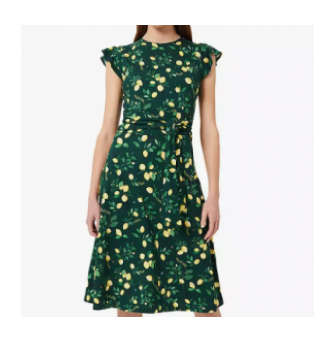
Hobbs Cici Lemon Print Midi Dress, Green/Multi £55, here