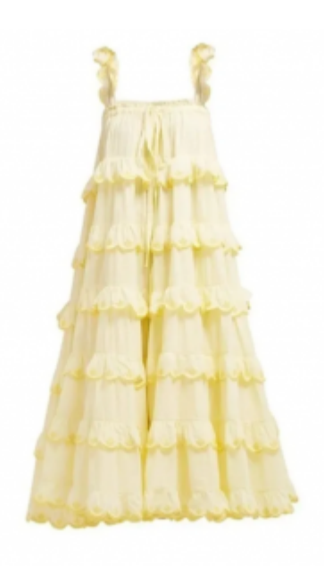
Mimi's Edit, Yellow scallop tier dress £74 — <a href="here">here</a>