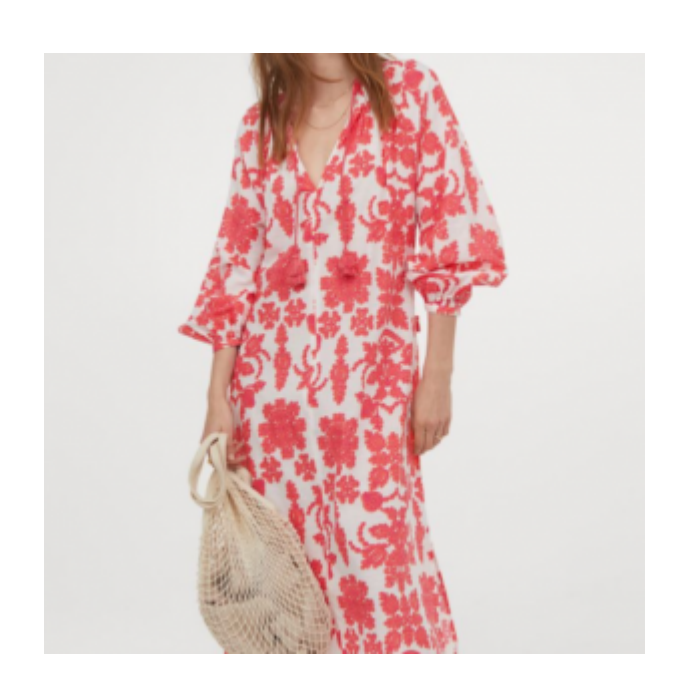
H&M Embroidered kaftan dress £39.99 — <a href="here">here</a>