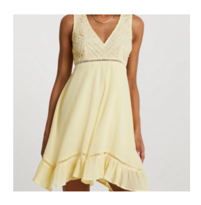
River Island Yellow 2 In 1 mini dress £50 — <a href="here">here</a>