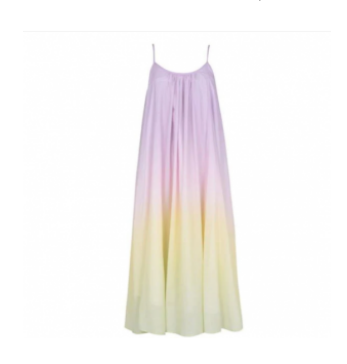
OLIVIA RUBIN, RUBIN AURORA DRS LD12 £135 — <a href="here">here</a>