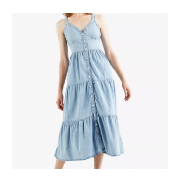
Levi's Sabine Denim Tiered Midi Dress, Light Indigo £47.50 — <a href="here">here</a>