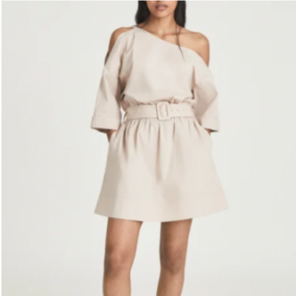
Reiss Demi one shoulder mini dress £188 – here