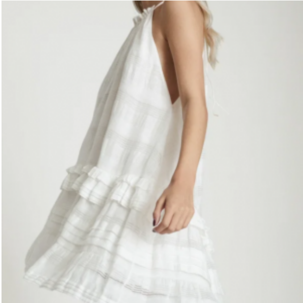
Reiss Gabriella Linen Blend Dress £195 – here