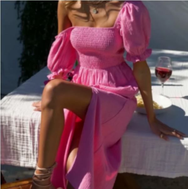
Mimi's Edit Brinley Midi Dress £76 – here