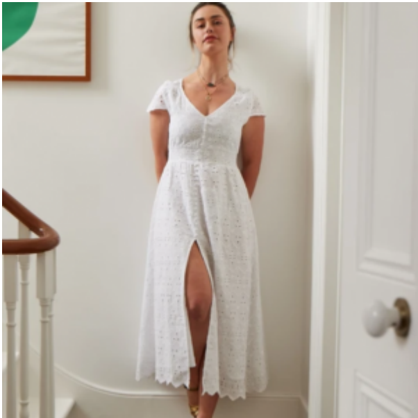
Marie & Lola Oriane Dress £79 – here