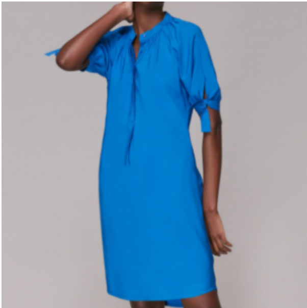
Whistles Celestine Dress £99 – here