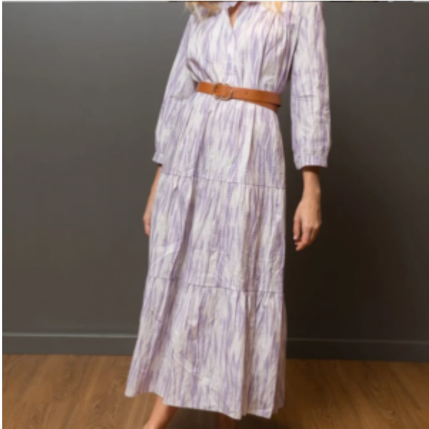
Marie & Lola Audrey maxi dress £69 – here