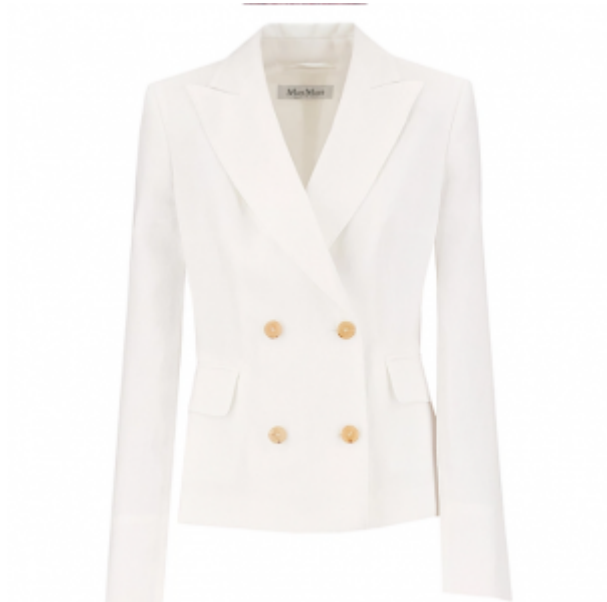
Max Mara Linen Blazer, £815 – here