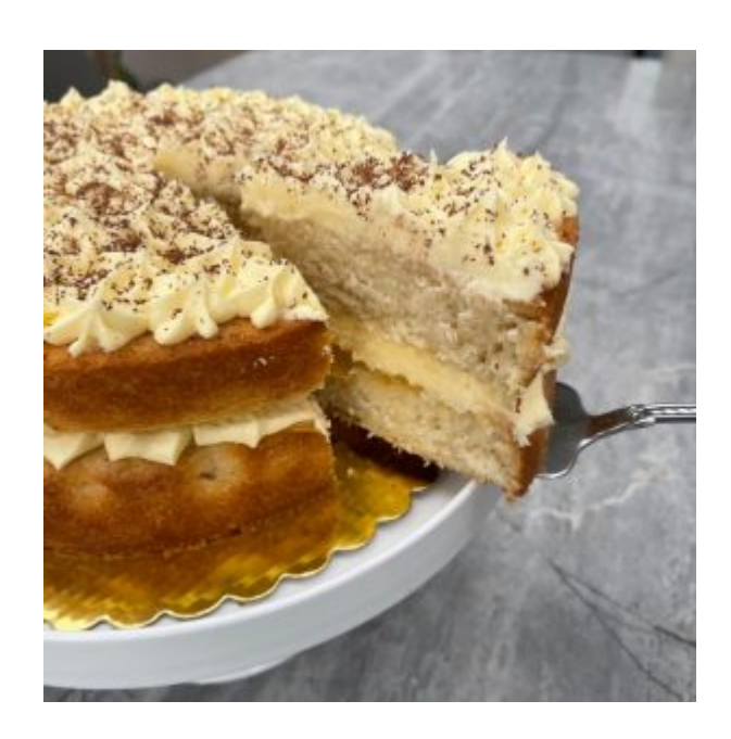
ENJOY! If you opt for The Ultimate Vegan Lemon Cake, please do share a picture!