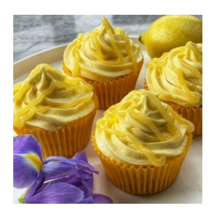
ENJOY! If you opt for Easy Lemon Curd Cupcakes, please do share a picture!