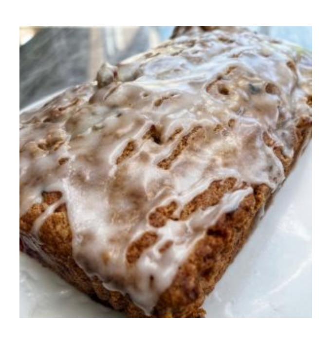
ENJOY! If you opt for Easy Lemon & Raspberry Loaf Cake, please do share a picture!