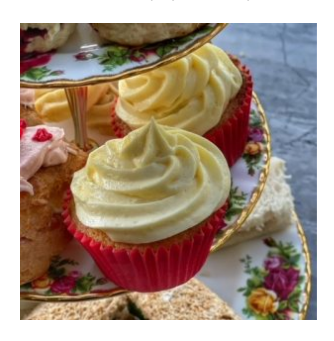
ENJOY! If you opt for Lemon & White Chocolate Cupcakes, please do share a picture!