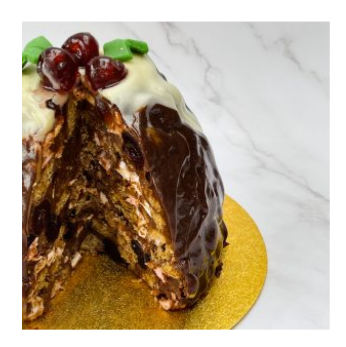
ENJOY! If you opt for Christmas Pudding Tiffin, please do share a picture!