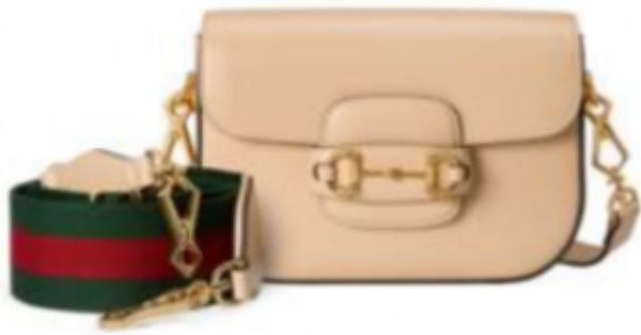
Gucci Horsebit 1955 mini bag – here