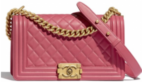
Boy Chanel Handbag Calfskin & Gold-Tone Metal Pink – here