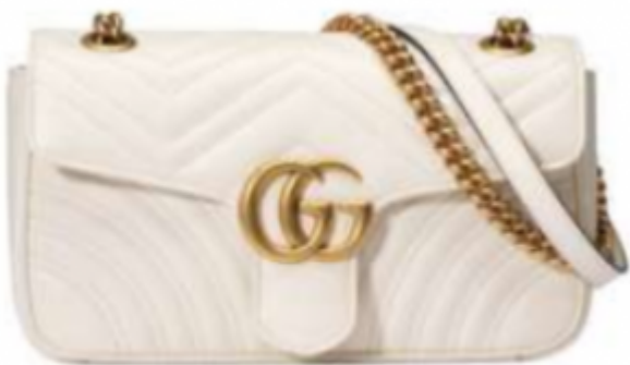
GG Marmont small matelassé shoulder bag – here