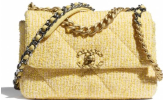
Chanel 19, Tweed, Gold-Tone, Silver-Tone & Ruthenium-Finish Metal, Yellow & Pink – here