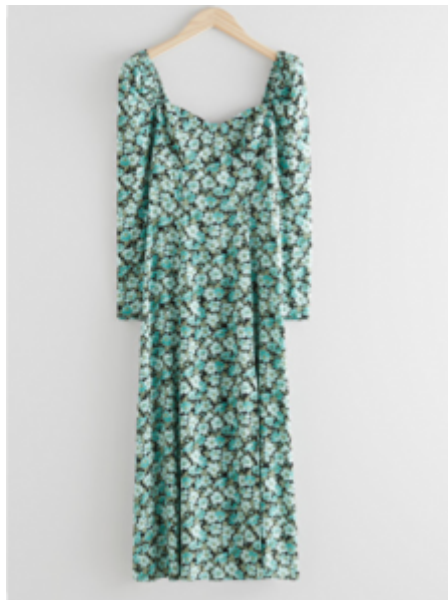
Puff Sleeve Midi Dress £46 – here