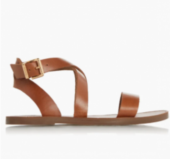
Leels – Tan Wrap Strap Flat Sandals, Dune £44 – here