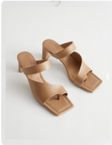
Square Toe Heeled Leather Sandals £47 – here