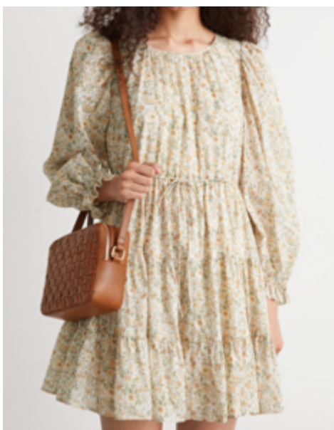
Voluminous Twill Mini Dress £56 – here