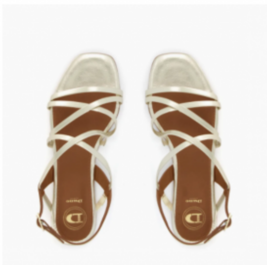
Larking – Champagne Thin Strap Flat Sandals, Dune £35 – here