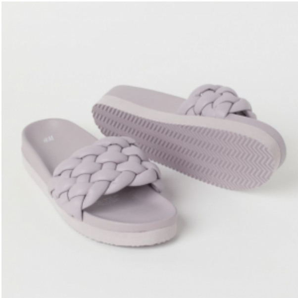
Braided Slides, H&M £19.99 – here