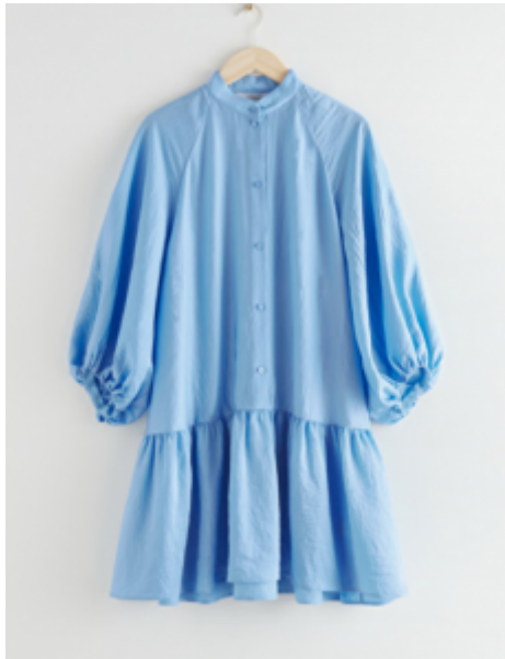
Voluminous Puff Sleeve Mini Dress £39 – here