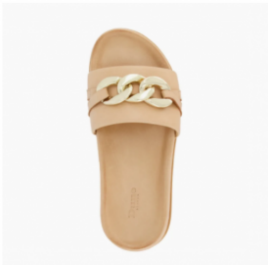
Leon – Camel Chain Embellished Slider Sandals, Dune £90 – here