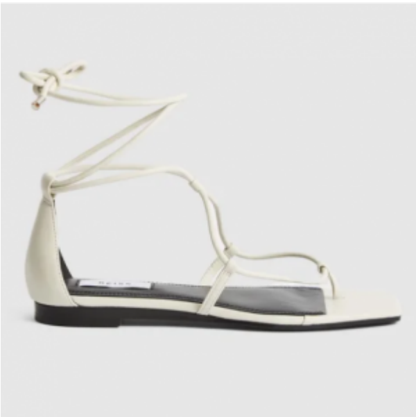
Kali Flat, Reiss £135 – here