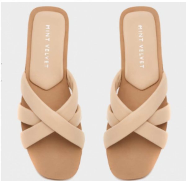
Bethanny Beige Padded Sliders, Mint Velvet £79 – here