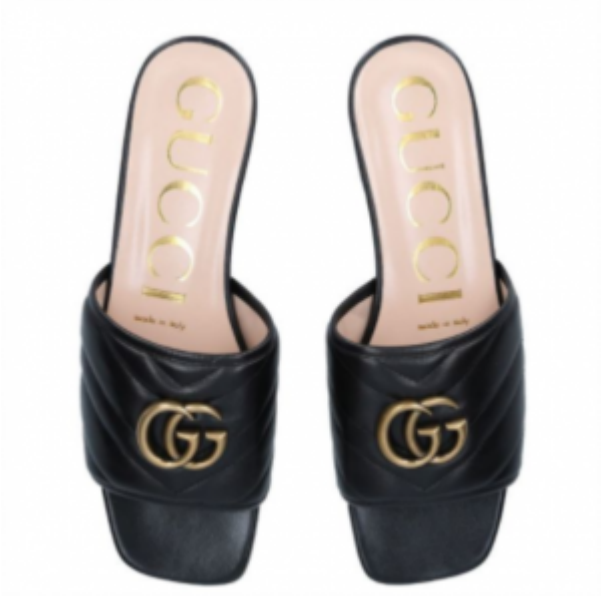
Gucci, Jolie Quilted Sandals, £485 – here