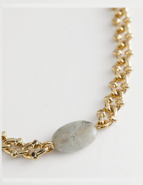
Stone Pendant Chain Necklace £21 – here