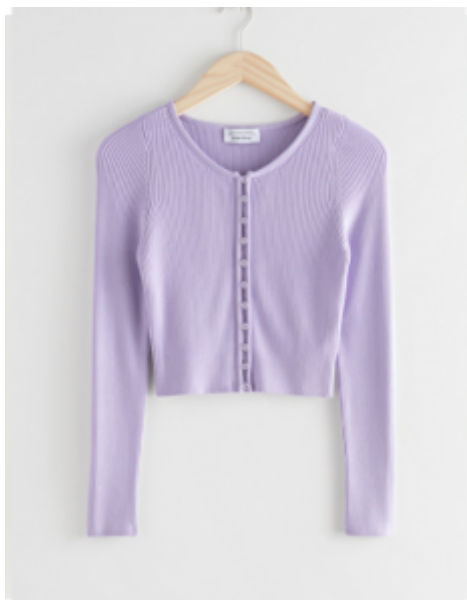
Ribbed Cropped Cardigan Top £26 – here