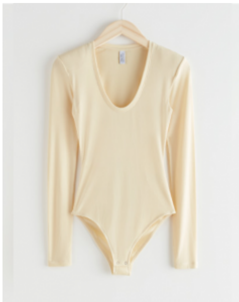
Fitted Padded Shoulder Bodysuit £20 – here