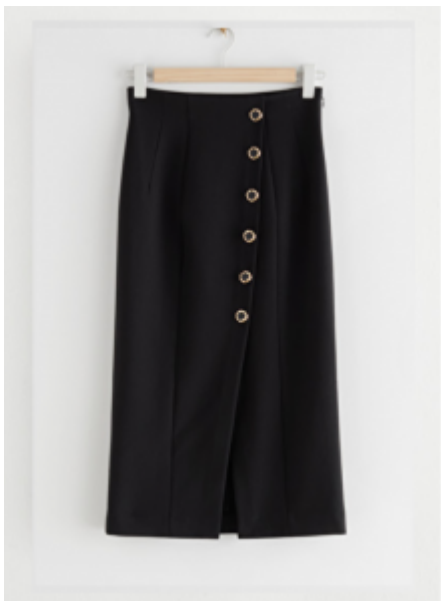
Fitted Asymmetric Pencil Midi Skirt £38 – here