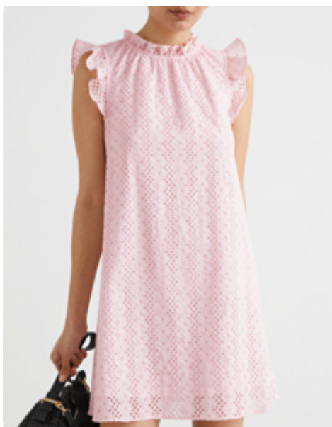
Frilled Broderie Anglaise Mini Dress £46 – here