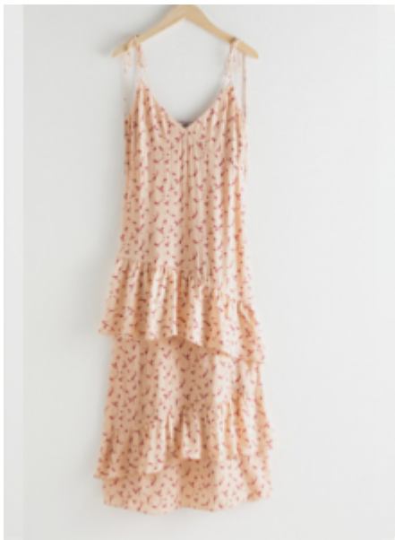
Ruffled Shoulder Tie Maxi Dress £42 – here