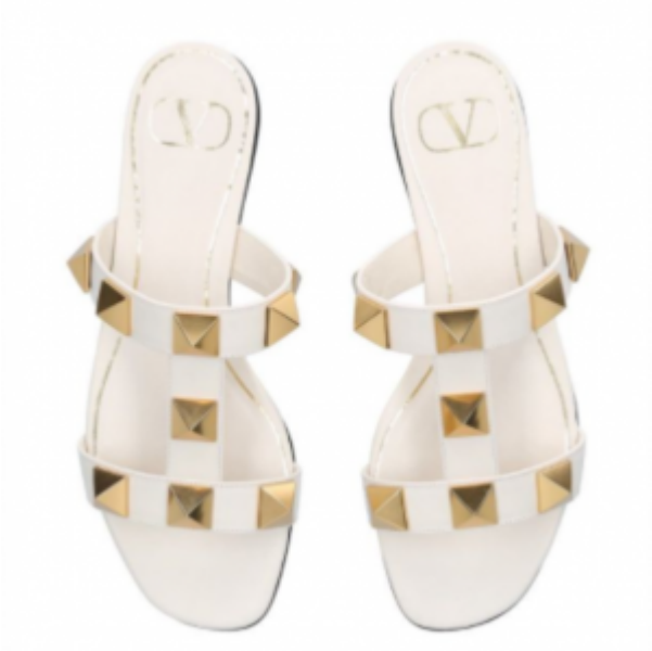
Valentino Garavani Leather Roman Stud Sandals, £590 – here