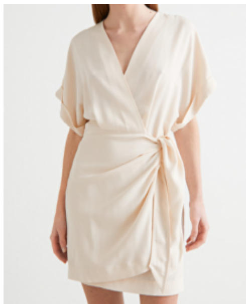
Relaxed Wrap Mini Dress £45 – here