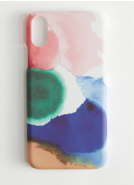
Watercolour Print iPhone Case £5 – here