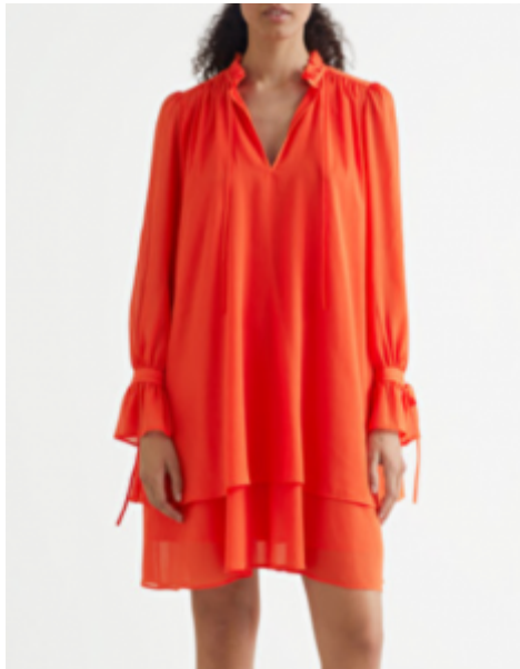
Flounced Tiered A-Line Mini Dress £62 – here