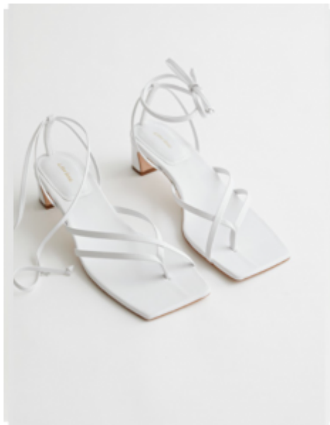
Thong Strap Heeled Leather Sandals £47 – here