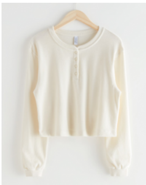
Boxy Pearl Button Top £26 – here