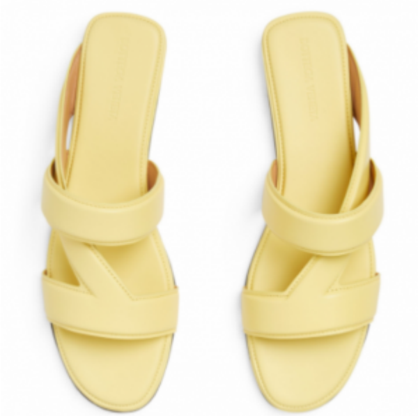
BOTTEGA VENETA Leather Band Flat Sandals, £560 – here