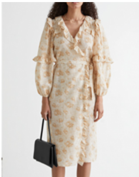
Voluminous Ruffle Wrap Midi Dress £68 – here