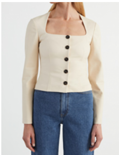
Fitted Buttoned Top £39 – here