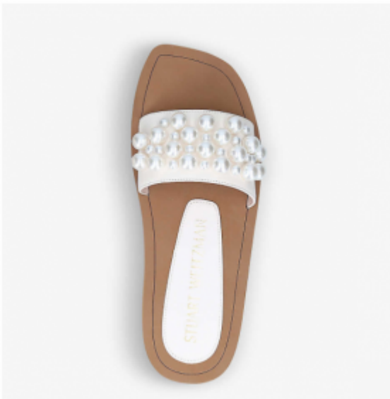
STUART WEITZMAN Goldie faux-pearl embellished leather sandals, £225 – here