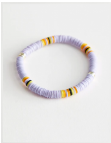
Beaded Bracelet £13 – here