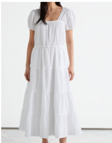
Voluminous Puff Sleeve Midi Dress £81 – here