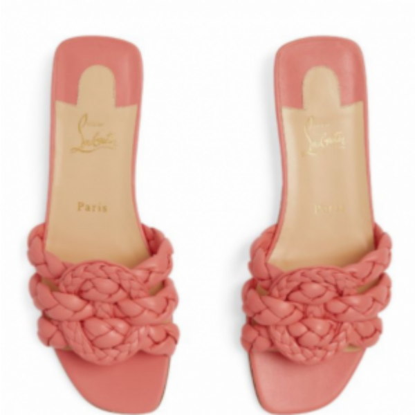
CHRISTIAN LOUBOUTIN Marmela Leather Sandals, £585 – here