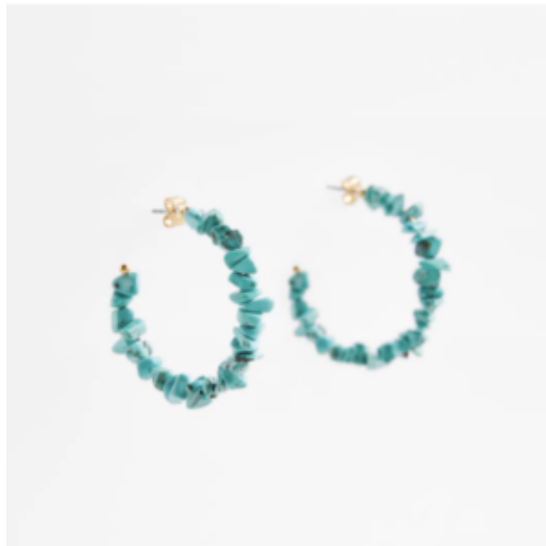
Pack of colourful bracelets, Zara £14.99 – here