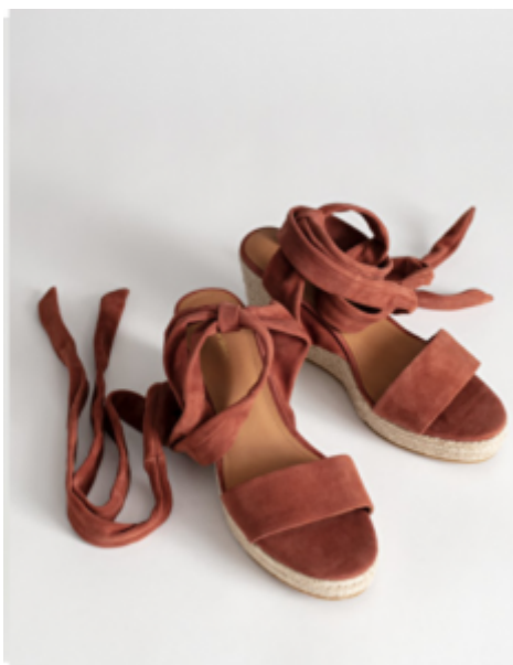
Suede Lace Up Espadrille Wedges £44 – here