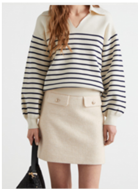
Flap Pocket Mini Skirt £31 – here