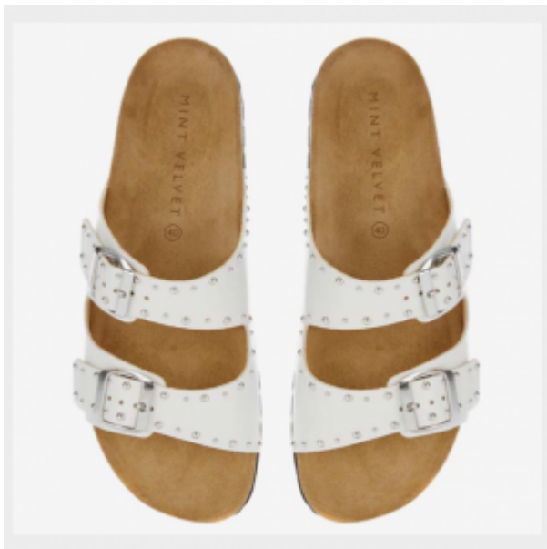
Lexi Stone Studded Sliders, Mint Velvet £79 – here