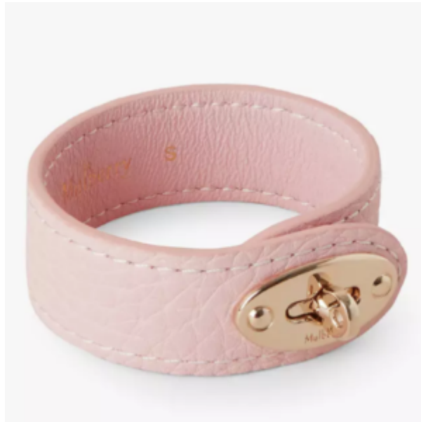
Hoop Earrings with coloured stones, Zara £11.99 – here