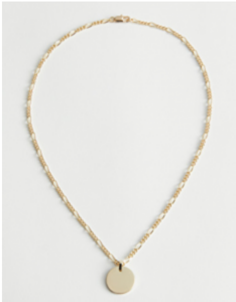
Coin Pendant Chain Necklace £13 – here