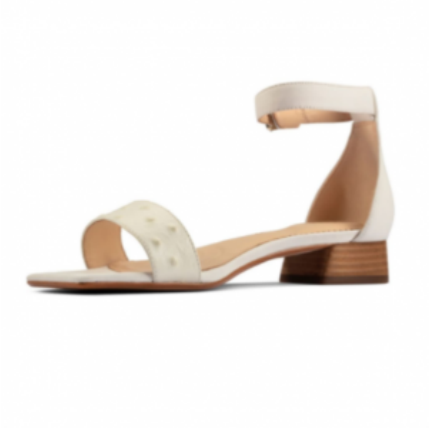
Sheer 25 Strap White Combi, Clarks £79 – here