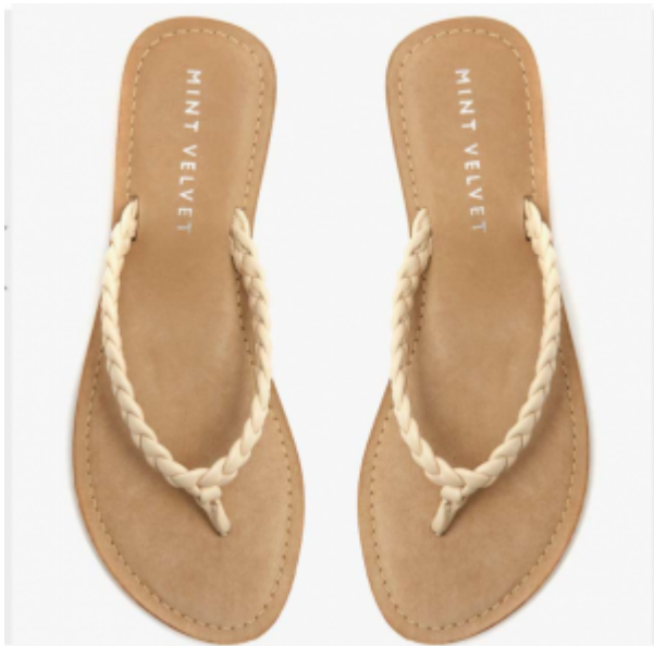
Ellen Beige Braided Flip Flops, Mint Velvet £59 – here