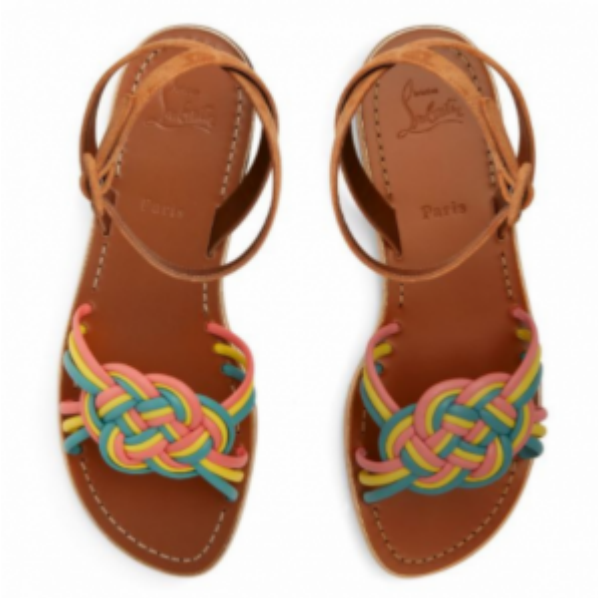
CHRISTIAN LOUBOUTIN Ella Leather Sandals, £585 – here