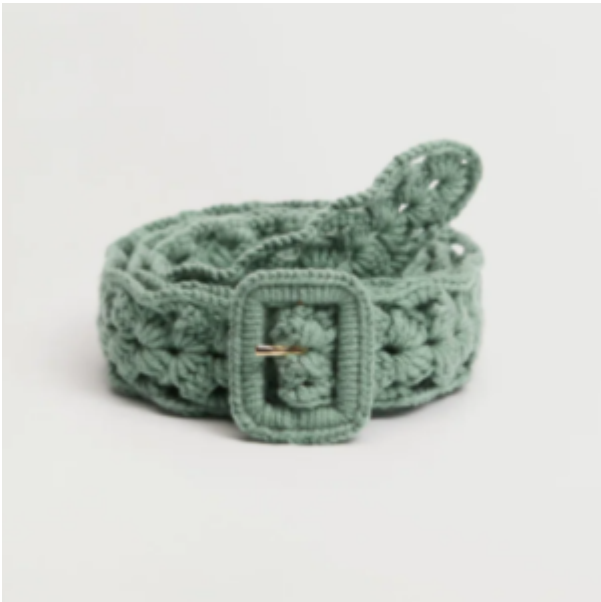
Leopard print belt, Whistles £55 – here