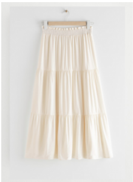
Smocked Waist Tiered Midi Skirt £48 – here