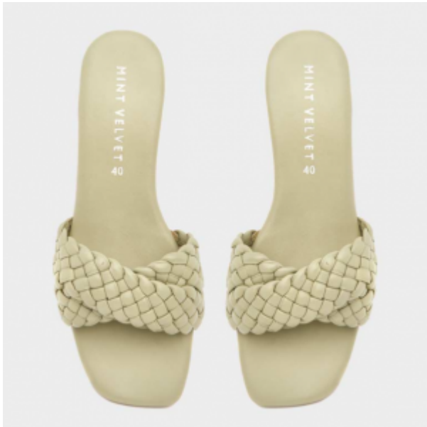
Hattie Sage Leather Sliders, Mint Velvet £79 – here