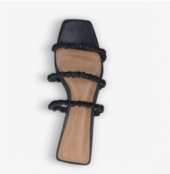
Who What Wear, Zela triple-strap leather sandals £79 – here