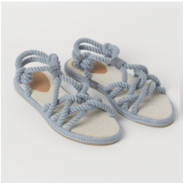
Light grey blue sandals, H&M £17.99 – here